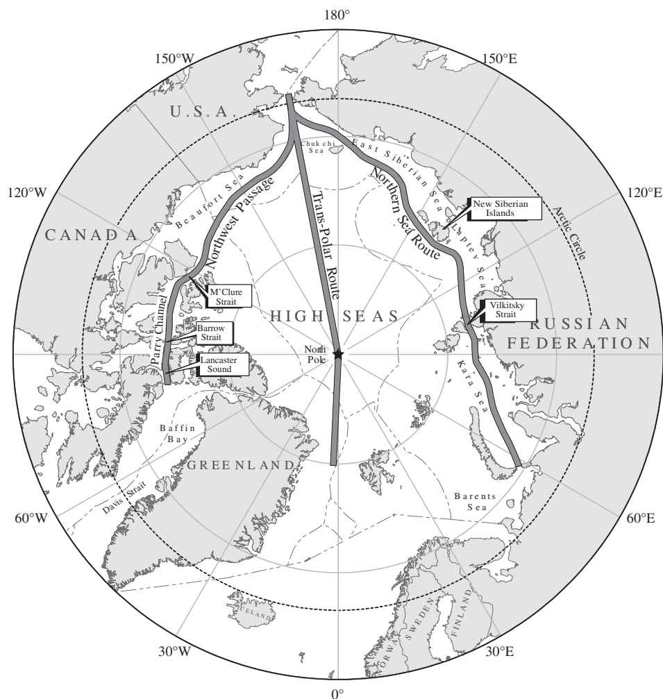
Figure 1. The NSR, The NEP, and Trans-Polar Route (adapted from Stephenson et al. 2013b).

Current, flowing toward the Northeast Atlantic (Rasmussen and Turner 2003, p. 68). A third option, the Transpolar Route traversing the North Pole, encounters thick and persistent ice. Even aggressive climate model scenarios project extensive sea ice in winter in the central Arctic for decades to come (Østrem et al. 2013).