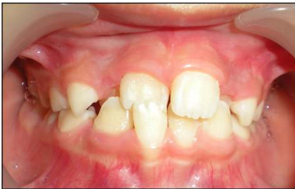
Fig. 7 Delayed exfoliation of maxillary right primary incisor caused ectopic palatal eruption of maxillary right incisor, crossbite formed

and biting. A lip bumper appliance can be used to break this bad habit. 53