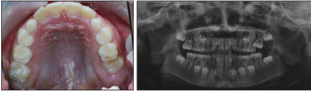
Fig. 5 Ectopic eruption of the maxillary left first permanent molar, loss of the upper left second primary molar; Left, intraoral photograph; Right, Radiographic illustration