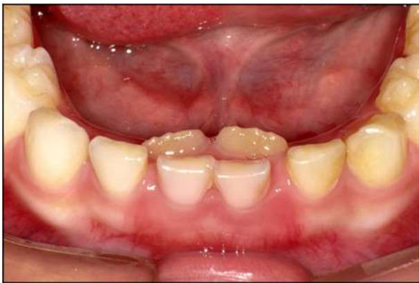
Fig. 6 Retention of mandibular primary incisor caused ectopic lingual eruption of mandibular permanent incisor