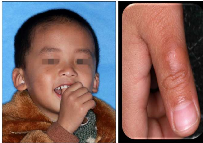
Fig. 8 Thumb sucking and deformation of the thumb