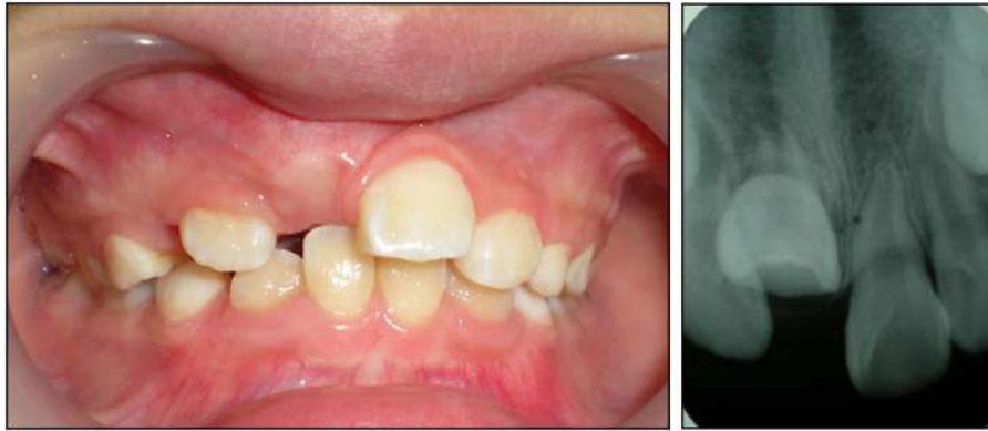
Fig. 3 Impaction of maxillary right central incisor (left), X ray film shows the dilacerated tooth (right)