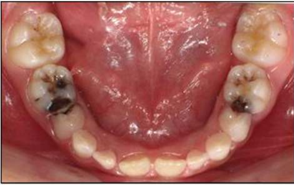
Fig. 1 Severe decay of the first and second mandibular primary molars, intraoral arch length decreased

food preference and dietary intake, relating to developmental delays. 20 Evidence also demonstrates a possible relationship between caries and body mass index. 21,22 So it is of great value for pediatric dentists to prevent and treat dental caries properly and optimal restoration of the morphology and function of primary teeth is in need to maintain and improve the oral health condition of young children in clinical practice.