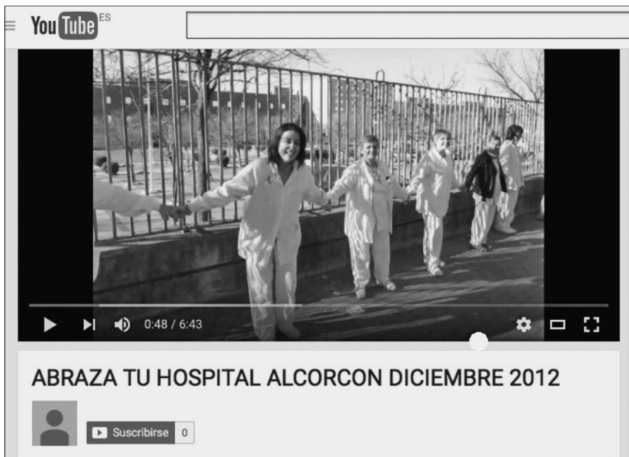
Image 2. Capture of YouTube's website hosting the video made on human chain "Embrace your hospital" organized by the White Tide and developed around the Alcorcón hospital, Madrid.

showing banners with slogans or performing escraches 1 to famous politicians are some of the most outstanding.