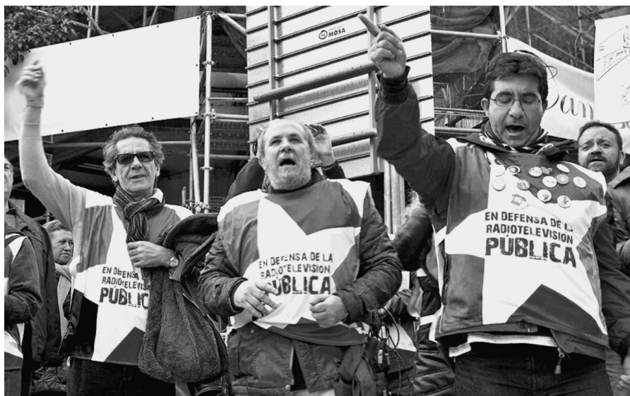
Image 1. Identification bibs with the star in the Telemadrid movement.

Telemadrid envisaged bibs with the silhouette of a giant star (image 1), of which they printed 5.000 units. The idea was adopted by the Green Tide, who did thousands of shirts of that color and the White Tide, that intensively used white color, popularly identified as the color of the hospitals. So, the health-care professionals went to demonstrations with their working clothes (white coats) and black bracelets as sign of duel; additionally, white sheets with black ribbons were hanged in the windows of hospitals and health centers, while groups of neighbors repeated that gesture as a sign of solidarity in their houses. Exploiting, in consequence, this visual position, the tides used profusely their representative color, applying it to all the iconography used.