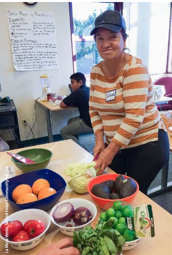
The LMV program offers cooking classes to help participants learn how to prepare and cook a meal using produce grown in their gardens.

In addition, we administered the same survey between September 2013 and April 2014 to 50 SNAP-eligible home gardeners participating in the LMV program. Interpreters helped translate the survey into Spanish or Chinese, and it was given to gardeners during community workshops. In total, just under 100 families were enrolled in the LMV program at the time of the survey. Open-ended