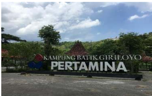
Fig. 7. The Main Gazebo Batik

Gazebo Batik is the place where most of the tourism activities are taken place. Despite the artisans can sell their products in the showroom (at the Gazebo complex), the Association allows artisans (accommodated by their group) to display, sell and promote their products through their shops or workshop.