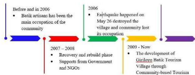
Fig. 4. The Chronological Order of The Establishment Giriloyo Batik Tourism Village.

Tourism development in Giriloyo initially began when an earthquake hit Yogyakarta and destroyed the whole village in 2006. In 2007 – 2008, the stakeholders helped the community to rebuild the village and recover from trauma. In between those years, the community received help from stakeholders (NGOs and government) that covered infrastructures, human resources development (training and capacity building), tools and materials, and financial capital as well. The community started to hold a gathering and forming small groups of Batik artisans (currently 13 groups) and united all groups in one organization called 'Paguyuban Batik Giriloyo' or Giriloyo Batik Association.