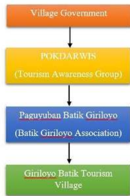
Fig. 5. The Hierarchy of Organization in Giriloyo Batik Tourism Village