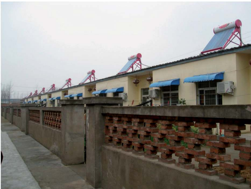
Picture 2 Family-style group homes for AIDS orphans in rural China