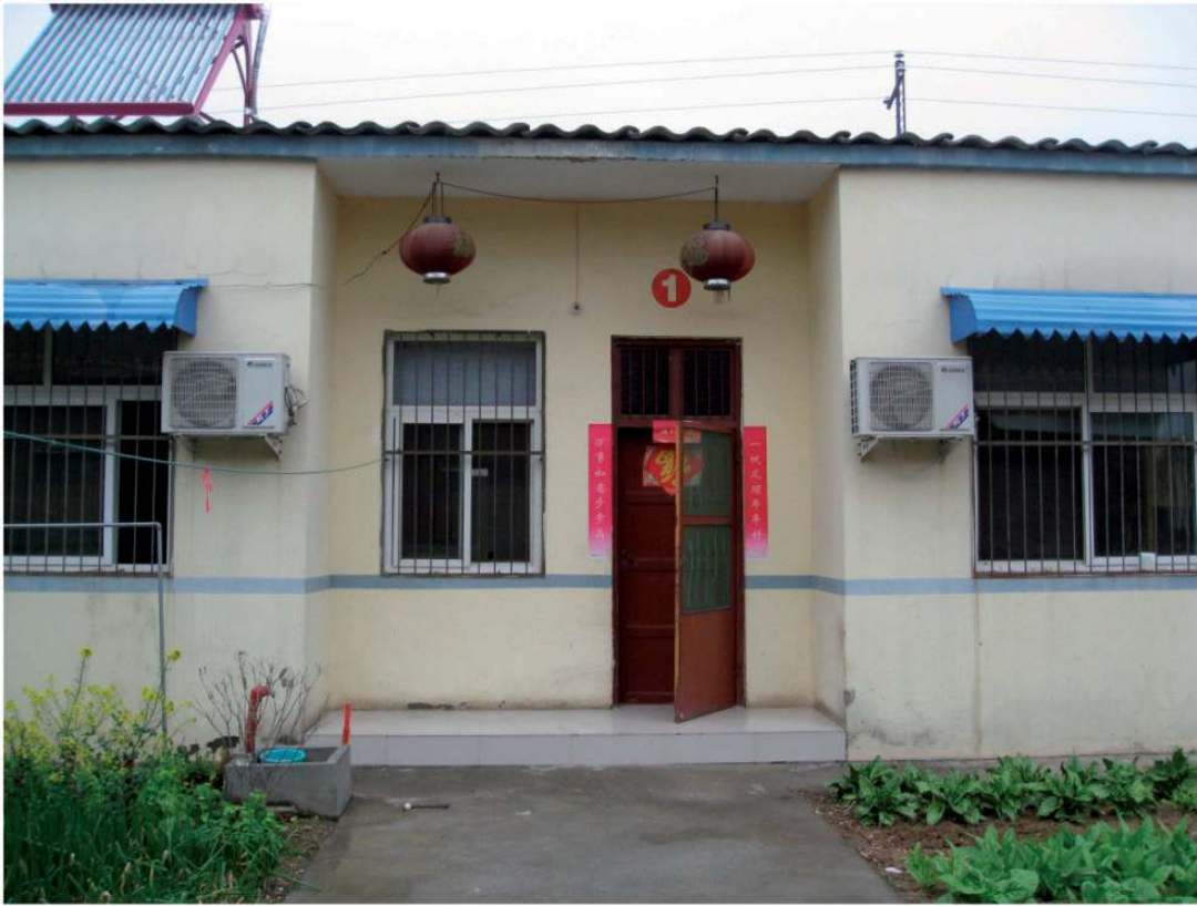
Picture 3 A typical group home in rural Henan Province, China