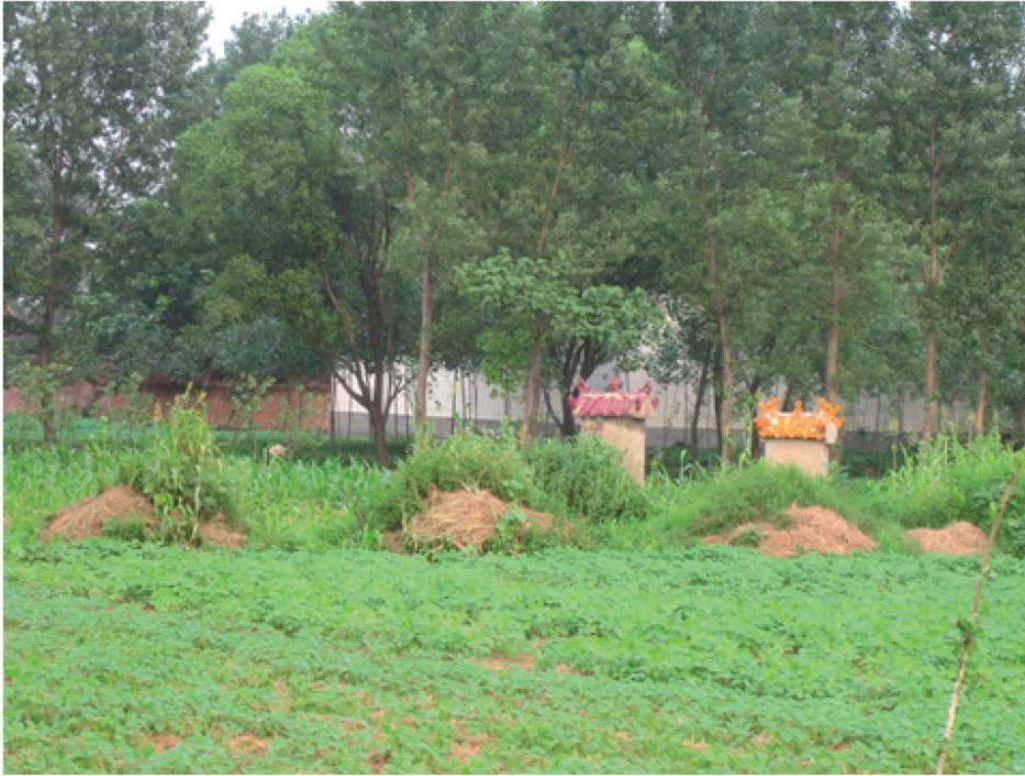
Picture 1 Village scene in an 'AIDS village' in rural Henan Province