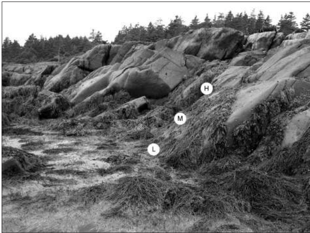
Fig. 1. Wave-sheltered rocky intertidal habitat from the Atlantic coast of Nova Scotia viewed at low tide, showing the extensive cover of furoid algal canopies at high (H), middle (M), and low (L) elevations.

found that positive effects are common under abiotically stressful conditions but weak or absent under benign conditions (He et al. 2013). That is a central component of the stress gradient hypothesis (Bertness and Callaway 1994), which has frequently been used to assume a continuous increase in facilitation intensity with abiotic stress (Maestre et al. 2009). More recent studies have begun to evaluate if the intensity of facilitation may actually often have a unimodal relationship with stress, especially when facilitation is evaluated at the community level (Michalet et al. 2006, Brooker et al. 2008, Holmgren and Scheffer 2010). An important reason for such a pattern could be that, under extreme stress, facilitators may be unable to ameliorate conditions strongly enough for many species (Holmgren and Scheffer 2010, He and Bertness 2014, Michalet et al. 2014). This paper investigates the facilitation-stress relationship at the community level using data from rocky intertidal systems.