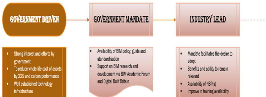
Fig. 2. The UK efforts to adopt BIM

Although, contract that supports collaborative BIM processes was amongst the recommendation by the Australian construction industry stakeholders, there is still no published contract form incorporating the BIM process in the Australian market, other than a bespoke contract which is conventionally adopted even at the highest of the most broadly used levels of BIM (level 2) [17].