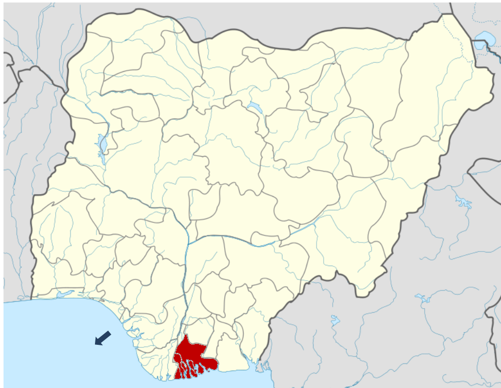
Figure 1. Map of Nigeria showing Rivers State.