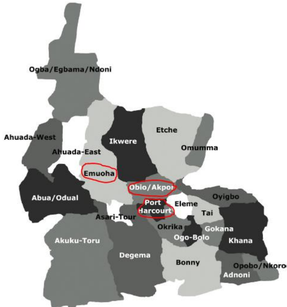
Figure 2. Rivers State showing all the LGAs with the study sites in red circles.