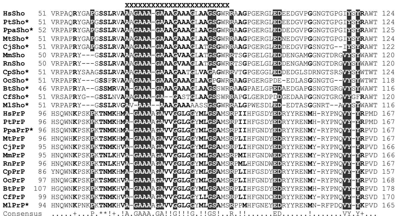
Figure 4 The conserved plastic PrP region compared with Shos. White letters on black background, conserved amino acids; bold, similar amino acids. X indicates residue in the highly conserved potential transmembrane region. In the consensus line: capital letters, conserved amino acids; +, conserved basic residues; *, conserved polar residues; !, conserved hydrophobic residues. Bt, Bos taurus ; Cf, Canis familiaris ; Cj, Callithrix jacchus ; Cp, Cavia porcellus ; Hs, Homo sapiens ; Mm, Mus musculus ; Mt, Macaca mulatta ; Oc, Oryctolagus cuniculus ; Ppa, Pongo pygmaeus abelii ; Pt, Pan troglodytes ; Rn, Rattus norvegicus . *, sequence annotated in this study.

One region in PRNP 3'-UTRs is conserved between human and mammals and birds (Figure 2B and Additional data file 3). This region includes highly conserved nuclear polyadenylation signals, and the 17 bp elements, which include the potential CPEs [23] and perfectly conserved 8 bp motifs abundant in human and mouse, rat and dog 3'-UTRs [32]. Indeed, PRNP was annotated as a likely CPE-specific RNA binding protein substrate in rat [33], and PrP is involved in the development of neuronal polarity in vitro [5].