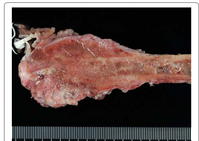
Fig. 1 Femoral osteosarcoma. Greyhound, 7 years and 7 months old. Dense sclerotic neoplastic proliferation with hard consistency at the level of the proximal metaphysis. The tumour infiltrates the medullary cavity and transgresses the cortical bone

A sarcoma is a malignant tumour originating in tissues derived from the mesoderm; affecting bone, cartilage and other connective tissues [20]. OSA is a sarcoma which produces bone or osteoid [21]. In both people and dogs, the gross appearance of the OSA is markedly variable, some being predominantly lytic (soft, fleshy and with areas of haemorrhage and necrosis), productive (hard consistency and variably grey in colour), or being a mix of both. It frequently transgresses the cortex at the same time that it grows within the medulla, rarely penetrating the joint (Fig. 1) [22]. World Health Organisation (WHO) defines OSA as a primary malignant bone tumour in which the neoplastic cells produce osteoid [22]. In both people and dogs, OSA is characterized by a highly pleomorphic and heterogeneous microscopic appearance, and it is divided into several histologic subtypes similar in both species (Table 1) [22, 23]. Commonly, these subtypes are typically mixed in the same tumour, which questions the significance of histologic tumour classification for prognostic purposes. Indeed, histologic subtype could not be demonstrated to influence biological