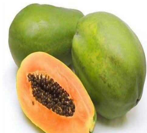
Plate 2. Carica papaya (Pawpaw) fruits