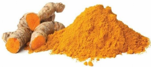
Plate 3. Curcuma longa (Turmeric) roots and powder