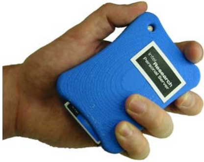
Figure 3 A Personal Server Prototype

Once again autonomic principles are required for this system to be successful, establishing a sense of self for the personal server and guarding against possible adverse data or programs that may be pushed onto it. In addition, proactive techniques are required for predicting the types of data the user needs, based on previous data access patterns, or the context of the user.