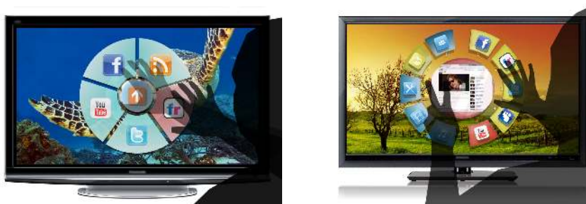
Fig. 1 Marking menus (Left), and Finger-Count menus (Right) on ITV.

We performed two experimental evaluations. The first one is based on the Wizard-of-Oz protocol to understand how users perform Finger-Count gestures in our free hand scenarios and to develop our Finger-Counting recognizer. The second study compares the three free hand menu techniques in an interactive TV scenario. Results show that all techniques achieve satisfactory accuracy. It also shows that Finger-Count menu requires more mental demand. Our findings are relevant for the design of free hand menu selection for public displays and interactive television.