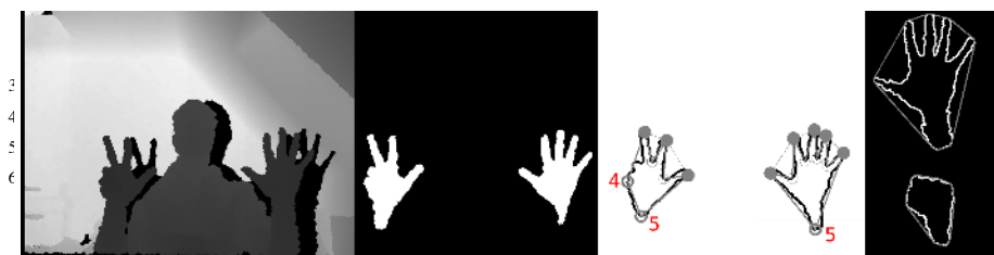
Fig. 3: left: depth map; middle: isolated hands; right: fingertip detection: hand contour (black), simplified hand contour (gray), fingertips (gray circles), vertices marked with 4 or 5 were removed from the list of fingertips in the corresponding processing step