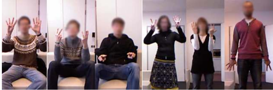
Fig. 2 Palm (ITV), Back (ITV), Fingertips (ITV), Palm (IPD), Back (IPD), Down (IPD).