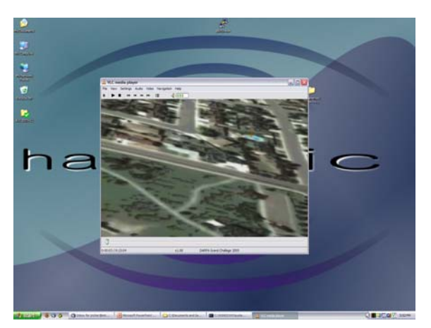
Fig. 2. Non-augmented video presentation. The video is shown in a stationery window of the same size as the video presentation in the augmented display.

"We've heard that several hunters are lost and a UAV is being used to search for them. Your job is to be a sensor operator for this rural search-and-rescue mission. The sensor in this case is a video camera and it is fixed to the UAV (you can't 'steer' the camera except by steering the whole UAV). To simplify training, we have pre-loaded a flight plan so that the aircraft will fly between the preloaded waypoints autonomously. In other words, you will not be directing the aircraft or camera. You will be looking at the information provided by the video camera and noting where the hunters are, as depicted by their blaze orange jackets. When you see each hunter, place a mark on this paper map indicating where you think the hunter is along with a label indicating whether it's the first hunter you see, second, etc. Don't worry if you're not completely accurate in placing each hunter on the map; the point is to use the paper annotations as rough guidance to a