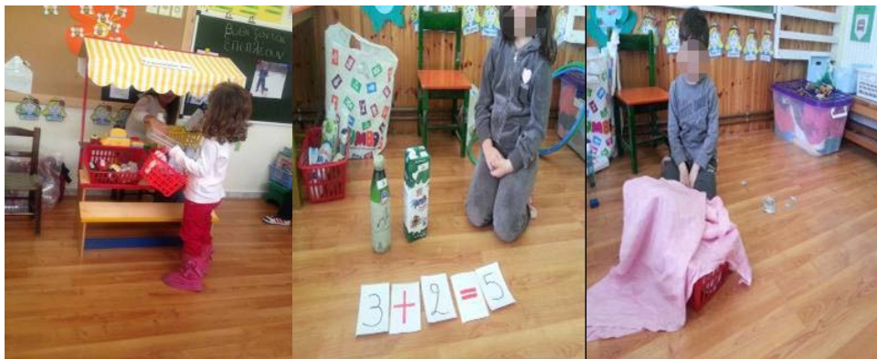
Figure 1 Illustrations from the activities of children

following the teaching plan drawn up by the teacher at the beginning of the school year. The objective of mathematical education in modern Greek kindergarten is to develop a way of thinking that exploits the features of mathematics. Preschool teachers shape the daily schedule of their teaching activities by combining knowledge from other school subjects taught in the preschool curriculum (Koustourakis, Zacharos, & Papadimitriou, 2013). It is intended that children begin to think in mathematical ways, realizing the value of using mathematics in real life (Kafousi & Skoumpourdi, 2008; Tzekaki, 2007) (Figure 1). Through daily actions and their interaction with the environment, children gradually explore all five axes whose trajectories are developed in the program of mathematics namely numbers and operations, space and geometry, measurements, stochastic mathematics and introduction to algebraic thinking (Zacharos, 2007).