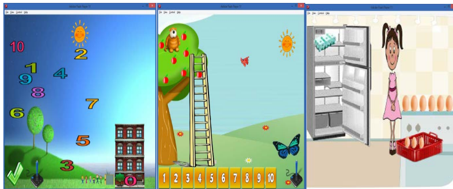
Figure 3 Illustrations of digital applications

The structure, plot, and script of the activities were similar for both types of digital applications. Respectively, icons, colours, props, sounds and other multimedia elements that were used to create mobile applications were identical to the corresponding applications on computers. The only difference between them was the different programming environment selected to implement them and the medium. With regard to the pedagogical dimension, the digital applications belonged to the category of "drill and practice" games with closed-ended questions. The applications were easy to handle and did not require the presence of an adult. Figure 3 illustrates some of the digital applications used in the intervention.