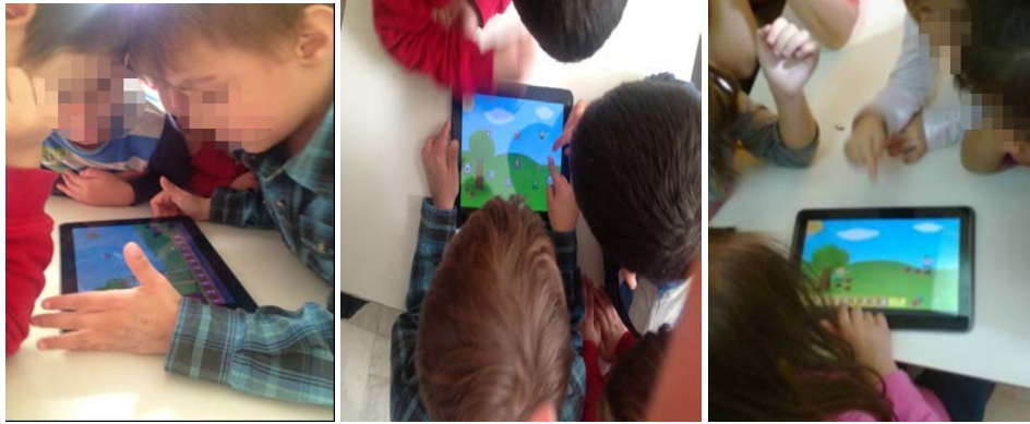
Figure 2 Illustrations of children activities with tablets

activities familiar to them, such as visiting a grocery store or a museum. Particular attention was given to the numbers used in order to reflect reality (tickets, commodity prices, money). Figure 2 illustrates some of children's activities with tablets.