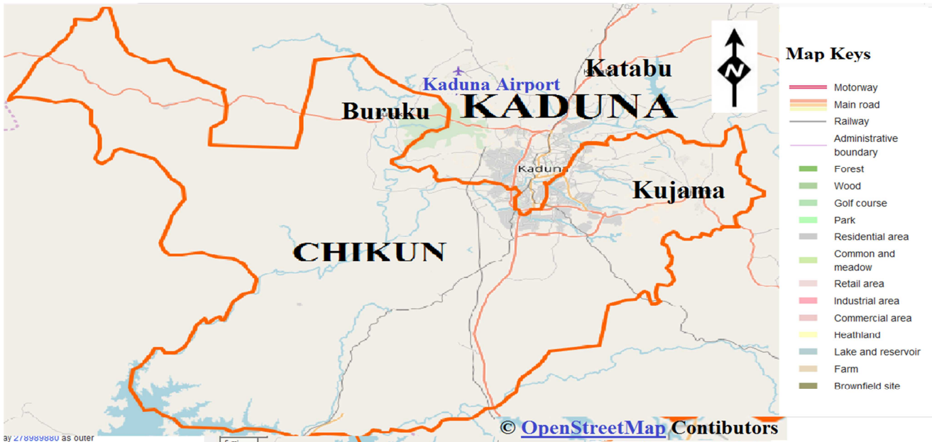
Figure 1. Map of Kaduna State Showing Chikun Local Government Area (Open Street Map Foundation, 2013).

35°C at the end of the dry season. The area is drained by a network of rivers (Figure 2), the drainage pattern is dendritic and the streams are all subject to seasonal water level fluctuations [7-9]. The location of Dams, river and streams in Chikun Local Government Area encourages fishing, irrigation farming, block making, spiritual activities, and swimming. Most of the people prefer washing and bathing in the river after a long day work of farming, fishing, rock breaking and block making.