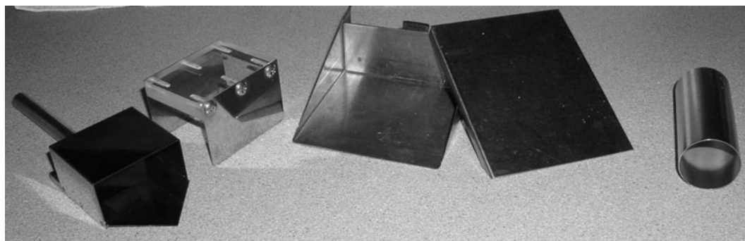
Fig. 1. Various types of density cutters tested for variance. Left to right: box (Hydro-Tech 100 cm 3 ), wedge (Snow Research Associates 200 cm 3 ) and tube (Wasatch Touring 100 cm 3 ).

type or rip cutter design is attributed to R.I. Perla and is presently manufactured by Snowmetrics in the USA. The wedge-type cutter tested was made by Snow Research Associates (SRA) and is no longer available (Fig. 1, middle). The Wasatch Touring density kit with a small, 100 cm 3 tube-type cutter (Fig. 1, right) was designed by S. Rosso and can be obtained through numerous sources worldwide. Specifications of the cutters are summarized in Table 1.