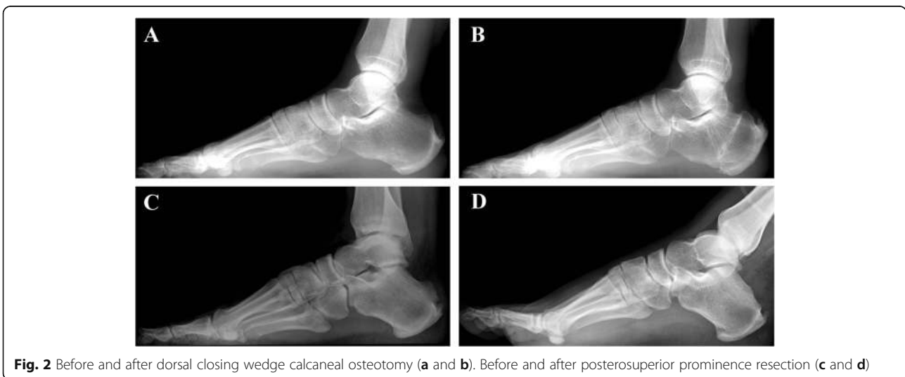
Fig. 2 Before and after dorsal closing wedge calcaneal osteotomy (a and b). Before and after posterosuperior prominence resection (c and d)

The series included a total of 44 patients; 12 patients comprised the DCWCO group and the other 32 comprised the PPR group. All patients were normal people, but not athletes, keeping a moderate amount of exercise. Patient demographics, including age, sex, BMI, operative side, smoking, and follow-up time, are summarized in