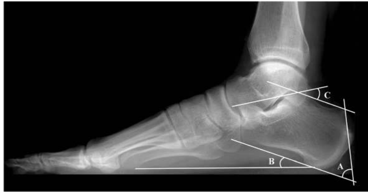
Fig. 3 Radiographic indices evaluated using standing lateral foot radiograph. a Fowler-Philip angle. b Calcaneal pitch angle. c Bohler's angle

Table 1. There was no significant difference between the two groups in terms of demographic parameters.