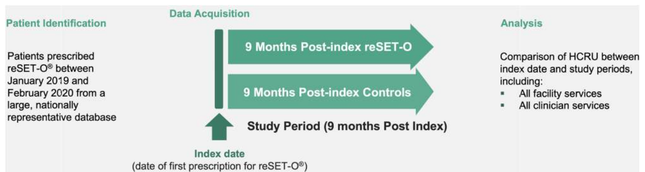
Figure 2 Study design.