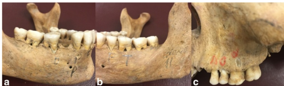
Fig. 2 The photograph of the defects, (a) dehiscences, (b) tunnel, and (c) fenestration

The observers were asked to define the type of the defects and also define the teeth without periodontal defects. In line with Braun's study [10], the defects were classified being present or absent or may have been uncertain while making the diagnosis (correct, false, or questionable). In addition, all of the images were evaluated by the same examiners. For this reason, the results, positive correct and negative-correct, were summarized as "correct." The answers: positive-false, positive-questionable, and negative-false and negative-questionable were considered "incorrect." The level of significance was accepted at p < 0.05 .