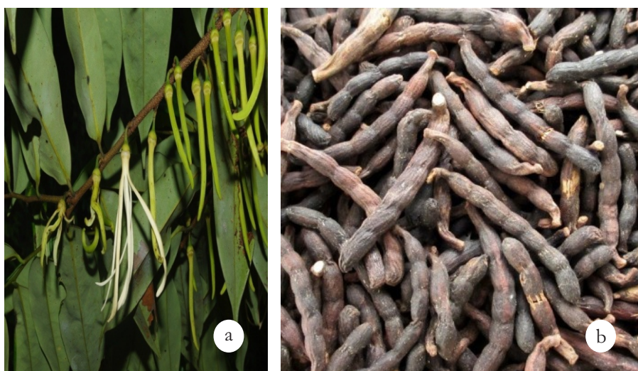
Figure 1: Xylopia aethiopica (Dunal) A. Rich (a) Leaves and young fruits, (b) Mature fruits

Values expressed as mean ± S.D; n= 3. Horizontally, means with different alphabet are significantly different from each other at p<0.05.