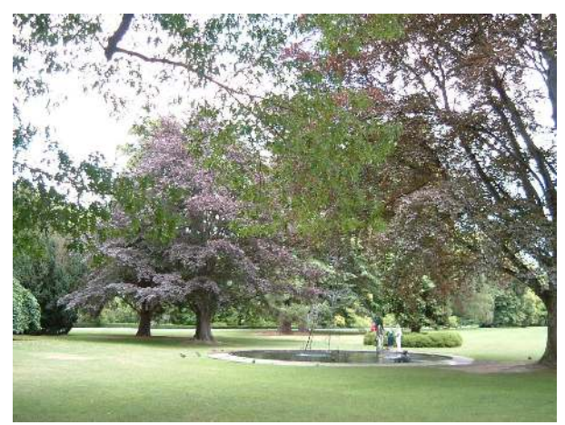
Fig. 15 Hagley park (December 2008)

In Christchurch, the three Town Belt structural levels described above were not included in the planning stage, and the Town Belt became a border between the Capital Town and the suburbs. The Town Belt's Park Land takes the form of one, massive park that functions in a way similar to Rural Zones by preventing the expansion of urban areas. Hagley Park (Fig. 15) provides a representative example. Beyond this Green Belt (actually, Rural Zone), satellite cities have been constructed that advance urban expansion.