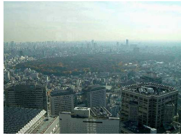
Fig. 2 Shinjuku sub-center in Tokyo viewed from Tokyo Metropolitan Government Building (November 2006)

Fig. 3 shows the city center of the capital Seoul in South Korea viewed from Seoul Tower. Although Seoul has one of the highest urban densities in the world shown in Fig. 4 and unipolar concentration in Seoul is high as in Tokyo, its green coverage rate is comparatively high among major Asian cities due to the many gardens around palaces and religious facilities in the city center.