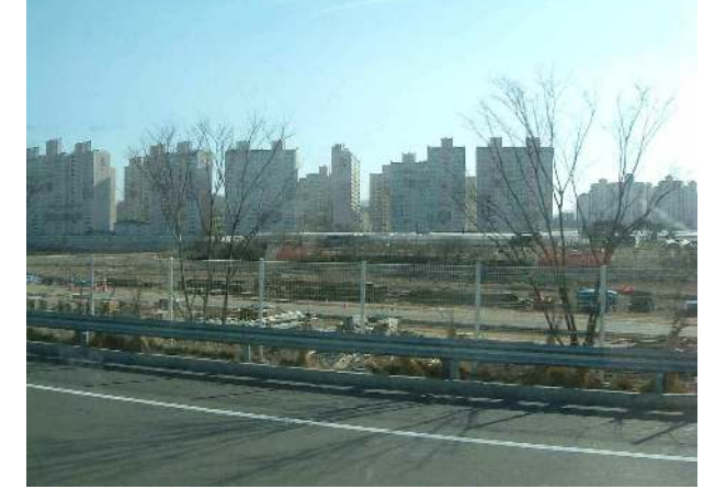
Fig. 11 Group of high-rise buildings constructed in the suburbs of Seoul following the lifting of Green Belt control (January 2003)

In recent years, however, South Korea has begun to release some areas from Green Belt control amid the rapid expansion of the Seoul Metropolitan Area. By 2020, a total area of 100,000 m^2 will be gradually released from Green Belt control and become an area subject to adjustments, thereby paving the way for residential development. Furthermore, under multi-regional urban development plans and urban development master plans, areas released from Green Belt control are defined as those subject to development. Fig. 11 shows a group of high-rise buildings that were constructed in the suburbs of Seoul following the lifting of Green Belt control.