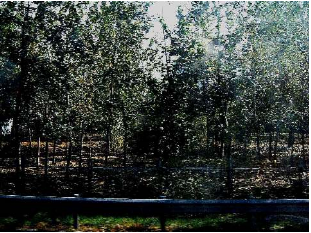
Fig. 16 The planting area in Beijing (October 2005)

As of 2004, the green space rate was about 30%, the green coverage rate was about 35% and the green area per population is about 20m^2 . About 18km^2 of green space such as parks and promenades are planned to be newly developed along the Huangpu Jiang and the Suzhou River, and the target for the tree planting coverage rate was 36% by the end of 2004.