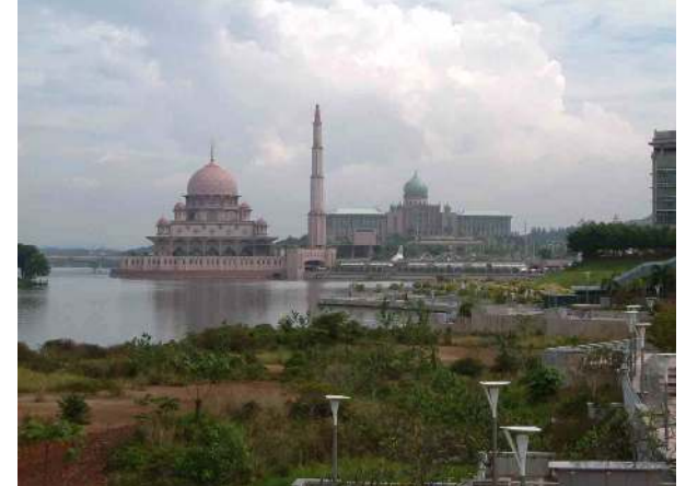
Fig. 13 Putra Lake, Putra Mosque and the prime minister's official residence in Putrajaya (November 2007)