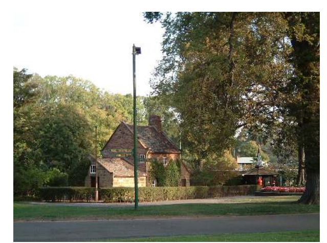
Fig. 14 Fitzroy gardens (February 2009)

Melbourne's center is surrounded by large green spaces such as the Fitzroy Gardens (Fig. 14), Albert Park and King's Domain. In Wallnumpool, which is located about 230km southwest of Melbourne, the outskirts are surrounded by reservations that function as Park Green Belts dotted by ponds, racetracks, cricket grounds and lakes.