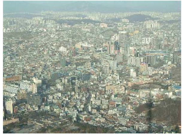
Fig. 3 Central Seoul viewed from the Seoul Tower (January 2004)