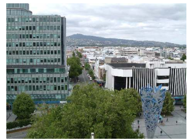
Fig. 9 Central Christchurch viewed from the tower of the Christchurch Cathedral (December 2008)