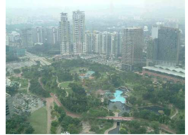
Fig. 7 KLCC Park and the city center viewed from the Petronas Twin Tower (November 2007)