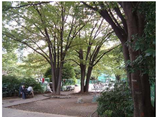
Fig. 10 Miyashita Park near JR Shibuya Station in Tokyo (October 2007)

The Green Belt concept changed with the enactment of the New City Planning Law in 1968. The law introduced a demarcation system dividing the urban planning area into two types of areas, the Urbanization Promotion Area in which urbanization is promoted and the Urbanization Control Area in which urbanization is restricted. Of these, the Urbanization Control Area inherited the idea of the Green Belt concept in that the designation of such an area was aimed at preventing the sprawling of urban areas. However, because the Urbanization Control Area was also defined as a candidate for future development, the original purpose of the Green Belt concept was lost. Then, in the third phase, the whole scope of a city was made subject to urban planning to promote the greening of urban spaces - including those under private ownership - on a small district level, rather than trying to develop green spaces of a certain designated scale or greater.