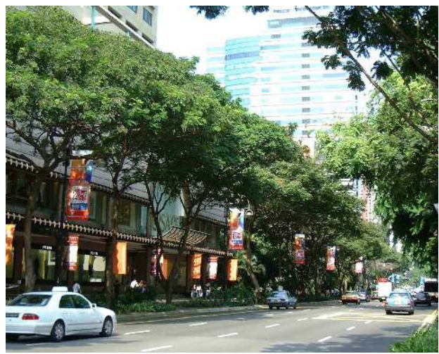
Fig. 12 Orchard Street in central Singapore (May 2002)

Fig. 12 shows Orchard Street, the largest street in central Singapore. From this figure, we can see that Singapore attaches great importance to the planting and maintenance of roadside trees as well as to the placement of green spaces.