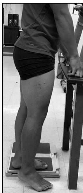
Figure 1. Standing ultrasonography collection position.

Following lying measures of LMT, LPA, and LCSA, standing measurements of muscle thickness (SMT), pennation angle (SPA), and cross-sectional area (SCSA) were collected. These methods were consistent with lying measures with one exception: for standing measures, the subject was upright and bearing weight on the opposite leg, which was positioned on a 5 cm tall platform, unweighting the measured leg and creating an internal knee angle of 160^\circ \pm 10^\circ (Figure 1). Three separate long-axis images and three separate short-axis images were saved for subsequent analysis, the same as were used for the lying measurements [9].