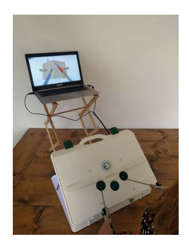
Fig. 1 The eoSim-augmented reality laparoscopic simulator interface

All statistical analyses were performed with IBM's SPSS statistics v.25 package. First the total scores for instrument handling, tissue handling and the amount of errors were calculated. Following, the inter-observer reliability was assessed by using Cohen's Kappa analysis for the task scores of instrument handling and tissue handling. A