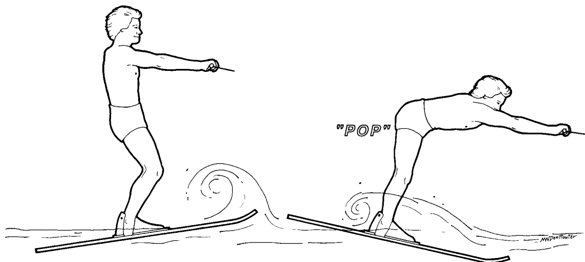
Figure 1. Sudden knee extension and increase in hip flexion avulses the hamstring origin.