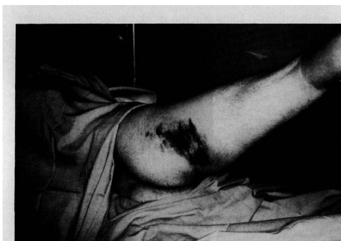
Figure 2. Ecchymosis at hamstring origin. No defect was palpable.