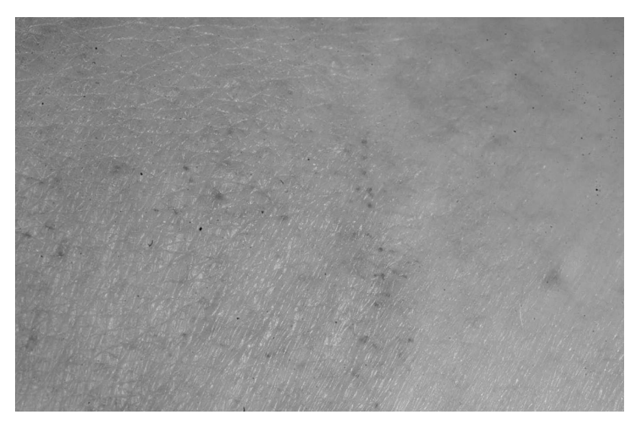
Fig. 2. Petechiae prior to CDP.

The most successful conservative therapeutical approach of lipedema is CDP. A critical component of CDP is MLD, a technique of gentle massage which is reported to stimulate lymphangiomotoric activity. It opens up and dilates uninvolved lymph