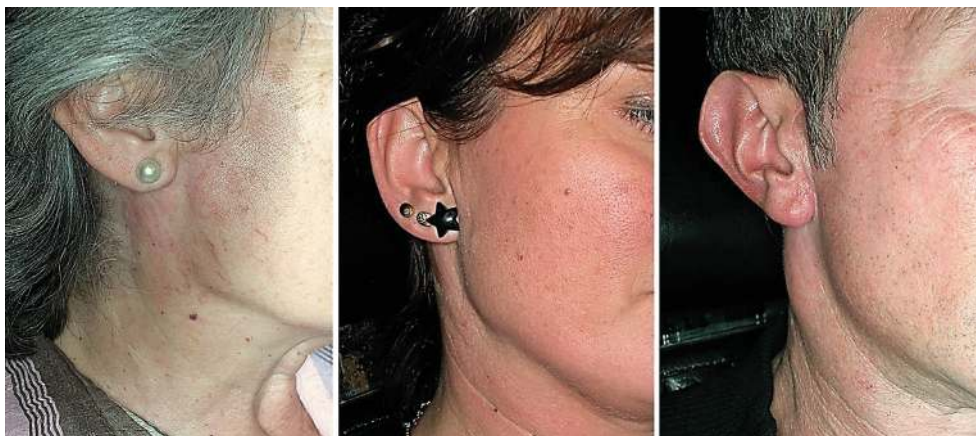
Fig. 3: Depression of the facial contour at 1 year. None (left), moderate (central) or major (right).