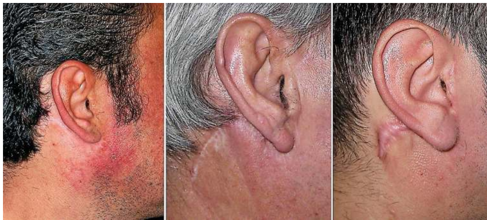
Fig. 2: Scar appearance at 1 year. Ideal (left), moderate (central) or hypertrophic (right).