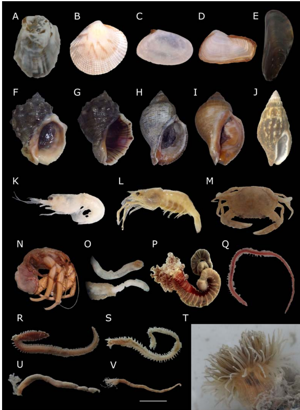
Figure 2. Macroinvertebrates associated with surface of the mangrove oyster C. rhizophorae : A) Crassostrea tulipa , B) Leukoma pectorina , C) Tellina diantha , D) Caryocorbula swiftiana , E) Mytella charruana , F) Stramonita haemastoma morph. 1, G) S. haemastoma morph. 3, H) S. haemastoma morph. 4, I) S. haemastoma morph. 2, J) Parvanachis obesa , K) Alpheus chacei , L) Macrobrachium surinamicum , M) Callinectes bocourti , N) Clibanarius vittatus , O) Sabellaria sp., P) Amphitrite sp., Q) Namalycastis abiuma , R) Alitta succinea , S) Perinereis ponteni , T) Bunodosoma cangicum , U) Amphiteis sp., V) Phyllocomus sp. Scale bar: 1 mm (Q), 3 mm (J, and U), 5 mm (B, C and V), 8 mm (D), 10 mm (K, N, P, Q, R and S), 15 mm (F, G and L), 18 mm (H and I), 20 mm (E, M and T) and 22 mm (A) / Macroinvertebrados asociados con la superficie de la ostra de mangle C. rhizophorae . Barras graduadas: 1 mm (Q), 3 mm (J y U), 5 mm (B, C y V), 8 mm (D), 10 mm (K, N, P, Q, R y S), 15 mm (F, G y L), 18 mm (H y I), 20 mm (E, M y T) y 22 mm (A)