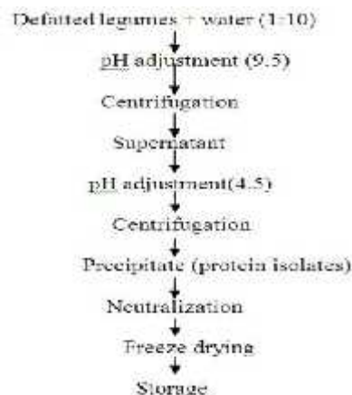
Figure 1: Systematic flow sheet for legume protein isolates recovery

In the nutshell, legume protein isolates with significant yield are important to be incorporated in protein based products development. Thereby, have tendency to be used as an alternate in the preparation of novel foods. Moreover, protein isolates from indigenous legumes can share the burden of protein demand among the masses.