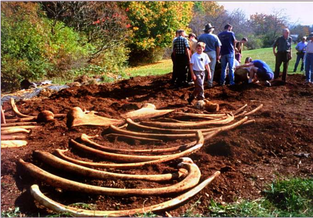
Figure 6-1. Whale bone remains following composting

and is biosecure. The temperatures achieved through the composting process may eliminate or greatly reduce pathogens, hindering the spread of disease. Research continues to demonstrate effective destruction of nearly all livestock diseases of concern. Properly composted material is environmentally safe and a useful soil amendment.