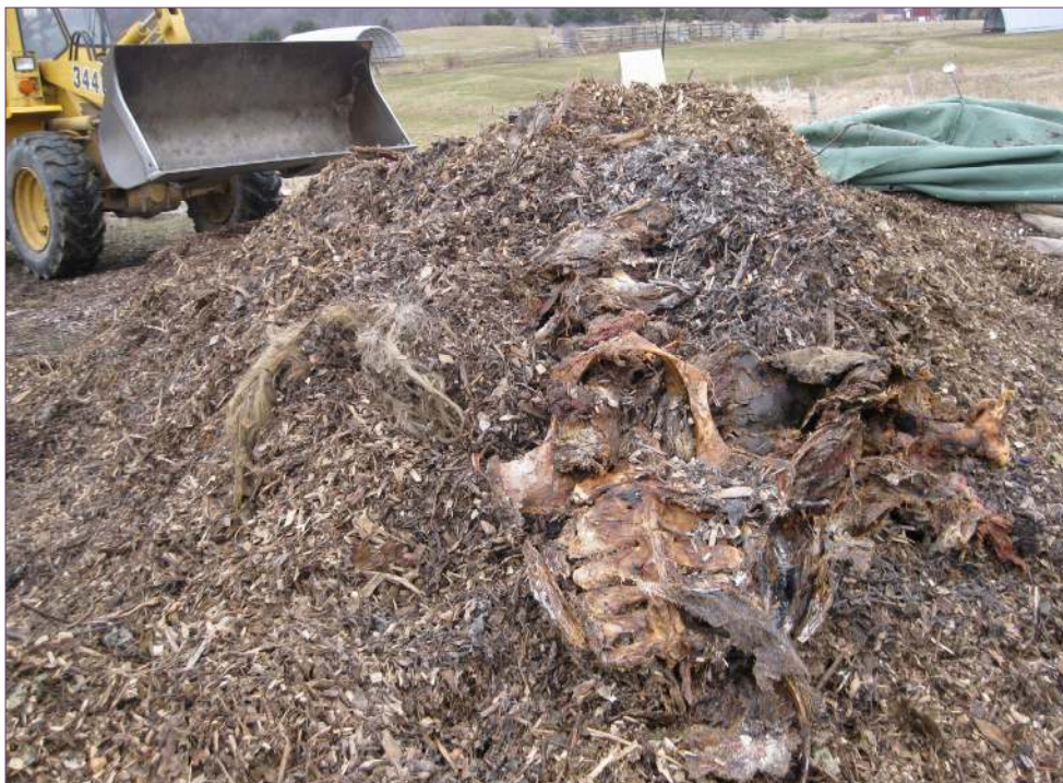
Figure 6-3. Compost pile opened after 4 months. Most of the soft tissue is gone, leaving some hide, hair and bones. The wood chips are dry on the outside having adsorbed and contained leachate and odors.

carcasses (e.g. birds and fish) and moderate carcasses (e.g. pigs, small deer and calves). However, a pile or bin cannot accommodate numerous layers of whole large carcasses, such as mature sows, cattle and horses. Larger animals are typically composted in a pile, windrow or bin with only one or two layers. As more animals are added, additional piles are started or the pile is expanded in length creating a windrow.