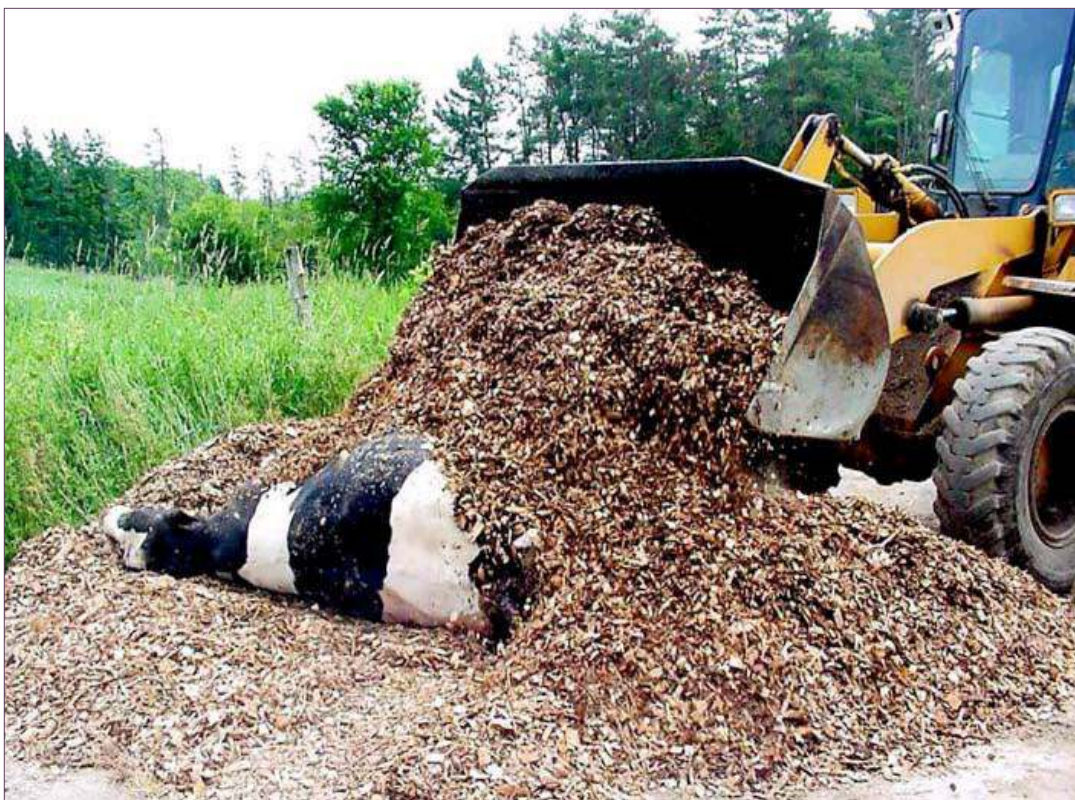
Figure 6-2. Enveloping a carcass with wood chips

Mortality composting methods evolved from the basic passively aerated pile or bin approach developed for composting poultry mortalities. With that approach, a number of carcasses are placed in a layer on a base of dry amendment and capped with more amendment. Layers are built upward in succession until the pile or bin reaches its desired maximum height (Figure 6-4). Layering predominates with small