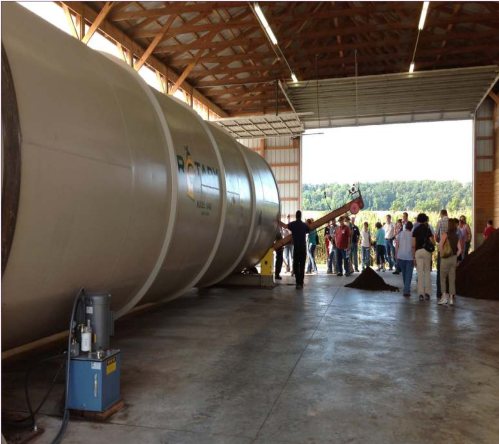
Figure 6-13. Rotating drum for carcass composting