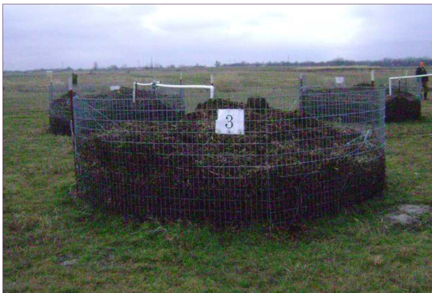
Figure 6-12. Wire bin mini-composter

Mini-composters represent a special application of passively aerated bins. They were developed for poultry but can be used for any small animals up to 30 lbs. (13.6 kg) including piglets, rabbits and fish. The beauty of mini-composters is that they can be located within the animal rearing areas and can be sized according to need.