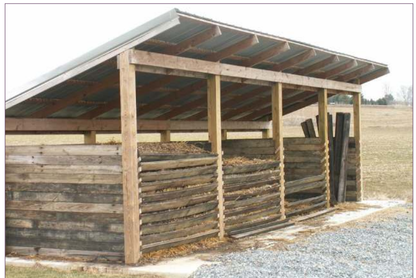
Figure 6-11. Example of a wooden bin used for poultry

Several common styles of mortality composting bins are available. The choice depends on factors that include the type of operation, animal species, regularity and