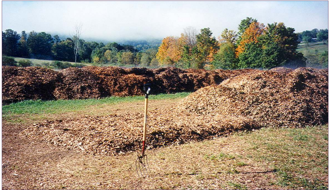
Figure 6-8. Static windrow composting with bed prepared for additional animals or butcher waste

weekly in layers, it is best to stair step the animals into the pile. Build the first end and extend a carbon bed out so that it is ready for additional animals. In the case of large animals, there is no middle layer, so this will be the final cover layer or biofilter and should be 24 inches (61 cm). When animals are added to the pile, dates should be recorded, especially the last one. If it is a windrow, dated flags can be placed in the pile to keep track; one end of a 100 foot (30 m) windrow will be finished before the other. Always make sure animals are well covered to avoid related problems (odor, vermin, etc.).