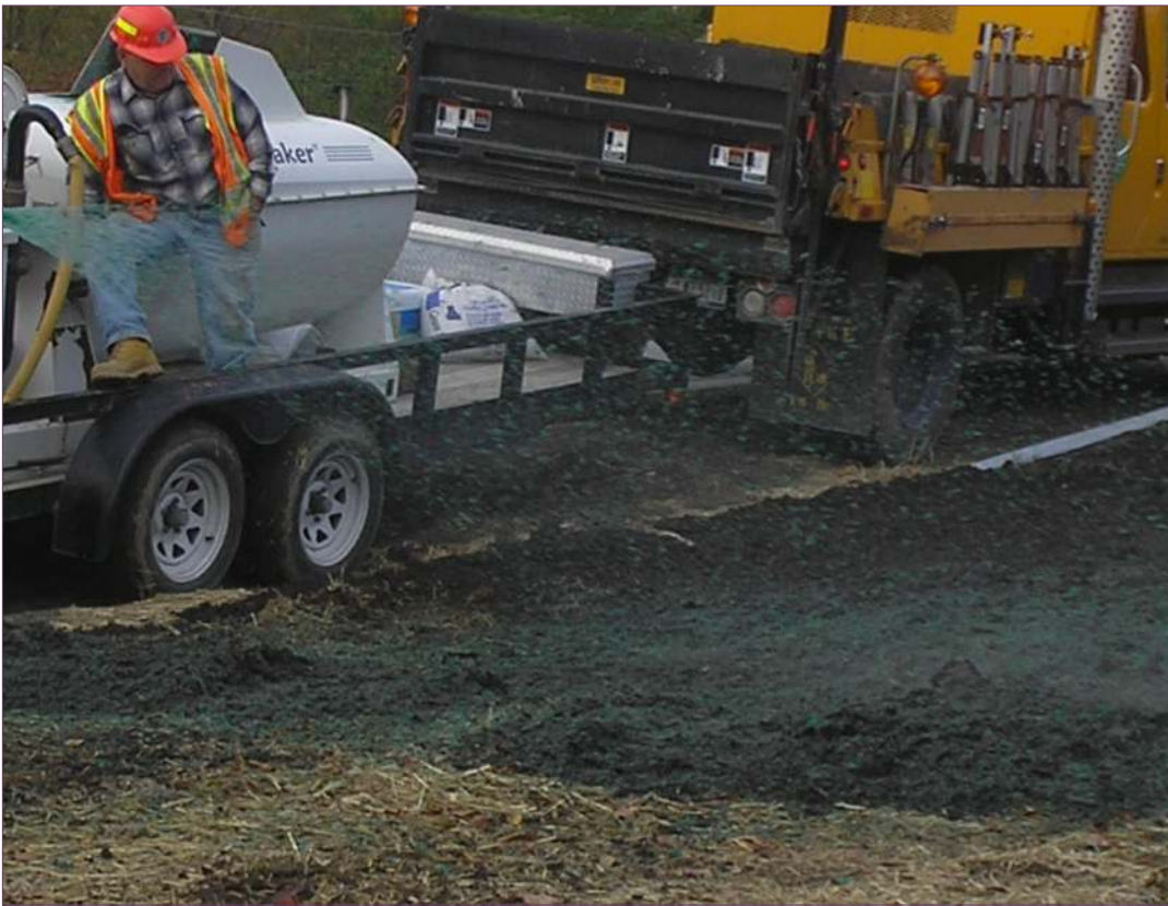
Figure 6-10. NYS Department of Transportation applying road kill compost along highway

compost undisturbed for roughly 2 weeks to 6 months, depending on the largest carcass size and management objectives. The pile/bin should be monitored for temperature, odors, and signs of scavengers, flies and leachate. Any problems that are detected should be corrected (Monitoring Compost Piles or Windrows). In the meantime, new piles or bins may be started to treat additional mortalities.