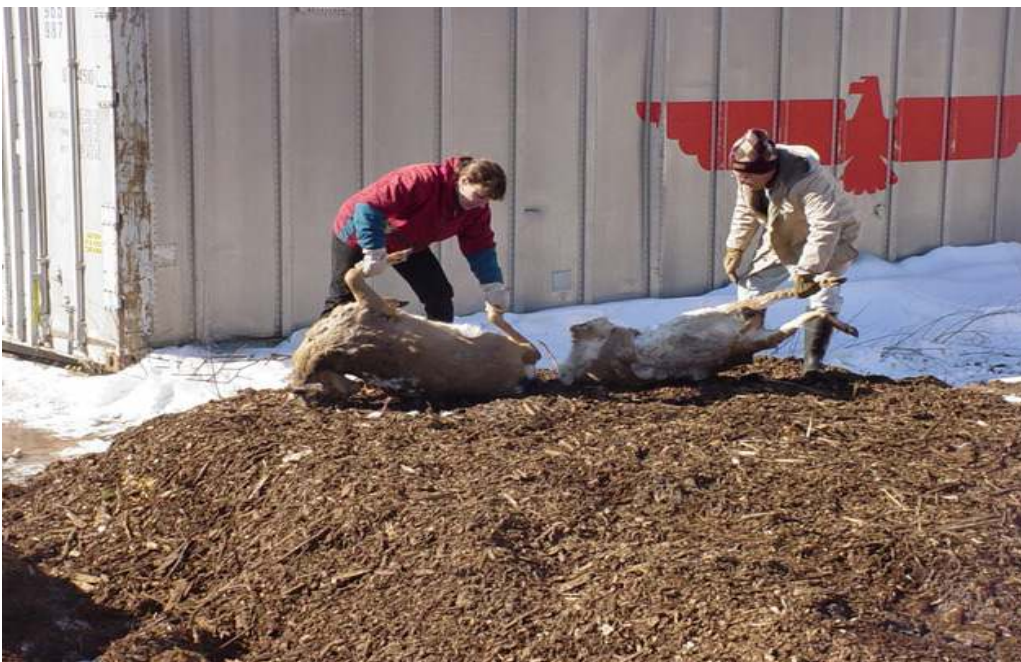
Figure 6-9. Deer carcasses placed on the base layer

4. Cap the pile or bin: The final layer of carcasses should be covered with a thicker layer of amendment. For small to moderate animals, 12 to 18 inches (30 to 45 cm) is typical. For large animals, 18 to 24 inches (45 to 60 cm) is necessary. The appearance of scavengers and flies means that the thickness should be increased. The same amendment used to cover intermediate layers can also be used for the final cap.