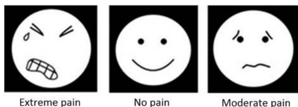
Figure 2. Facial pictograms. Participants were requested to arrange them from no pain to extreme pain (written descriptions not presented to participants). Developed by Sclera ( http://www.sclera.be ) in 2012.

Four pictograms for pain qualities were developed by Sclera, a Belgian non-profit organisation for graphic