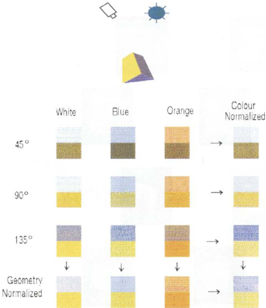
Fig. 1. A yellow/grey wedge, shown top of figure, is imaged under 3 lighting geometries and 3 light colours. The resulting 9 images comprise the 3 \times 3 grid of images shown top left above. When illuminant colour is held fixed, lighting geometry normalization suffices (first 3 images in the last row). For fixed lighting geometry, illuminant colour normalization suffices (top 3 images in the last column). The comprehensive normalization removes the effects of both illuminant colour and lighting geometry (the single image shown bottom right)