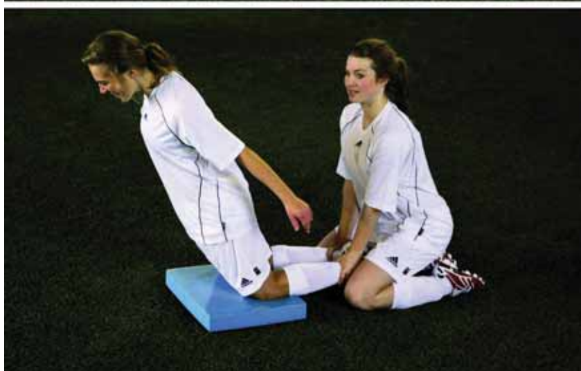
Fig 1 | Two examples of strength exercises. Top: side plank exercise. Bottom: the "Nordic hamstring lower"

Monica Orthopaedic and Sports Medicine Research Foundation, and the FIFA Medical Assessment and Research Centre, developed the warm-up programme. Before the start of the study one club tested the programme. It consisted of three parts (table 1). The initial part was running exercises at slow speed combined with active stretching and controlled contacts with a partner. The running course included six to ten pairs of cones (depending on the number of players) about five to six metres apart (length and width). The second part consisted of six different sets of exercises; these included strength (fig 1), balance, and jumping exercises, each with three levels of increasing difficulty. The final part was speed running combined with football specific movements with sudden changes in direction.