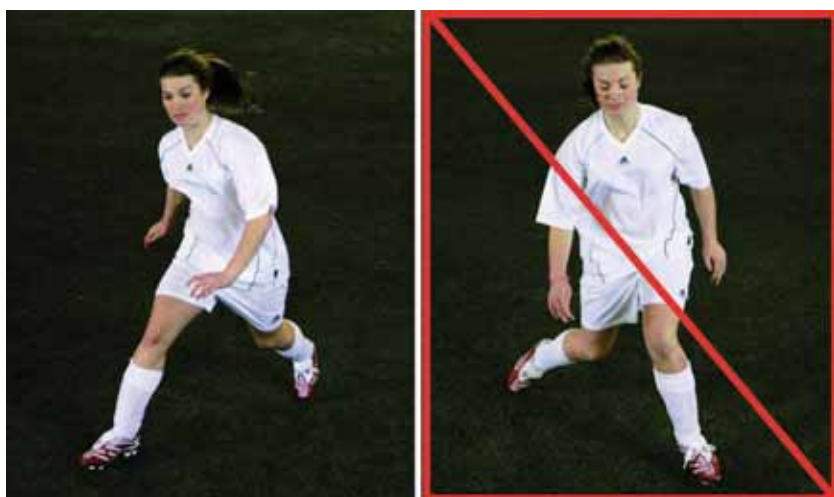
Fig 2 | Example of running exercise illustrating key objectives of all running, jumping, cutting, and landing exercises: core stability and correct lower extremity alignment. Left: correct technique; right: incorrect technique with pelvic tilt and knee valgus alignment to right

per club and a dropout rate of 15%, which means that we needed to include about 120 clubs with 2150 players.