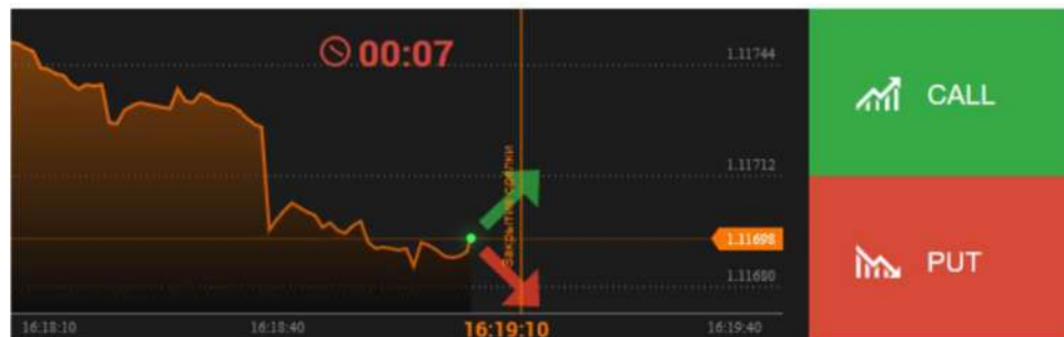
Fig. 1. Example of an advertisement for a binary option.