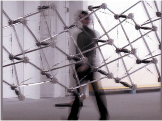
Figure 3. A prototype of an actuated tensegrity structure, courtesy of oframBFRA [5].

compression members which meet in a tripod formation that is held together by tension cables [5]. This forms a structure that can be subjected to alteration in tensions within each module causing the local rigidity to change and thus induce the entire structure to change shape [5]. Thus, by introducing an actuator controlled by computations on the apex of each module the tensegrity can perform controlled transformations between a wide number of states [5]. This is an example of a composite material where the complexity of the structure within the material resembles that of wood, but as it is presented by oframBFRA, to a much larger physical scale. The tensegrity can be covered by membranes, which enables it to form shelter and separate spaces. The dimension and control of the tensegrity are not a given; it can be scaled to suit different needs, and the controls can equally be designed for those purposes. oframBFRA suggests that the controls should rely on predetermined algorithms and let the data for the algorithms be dynamically collected through sensors that detect changes in the immediate environment.