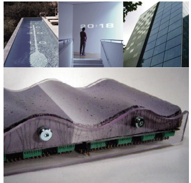
Figure 2. Example of computational concrete, courtesy of Glaister, Mehin, and Rosen [9]

Another example that relies on a similar type of composite structure is the Chronos Chromos Concrete (see fig. 2). This computational concrete is a composite material that holds the properties of ordinary concrete and still is able to dynamically display text or other patterns through color change [9]. The material behind the color change is thermodynamic ink, which is blended into the concrete. Beneath the concrete surface are mounted nickel chromium wires that heat up when