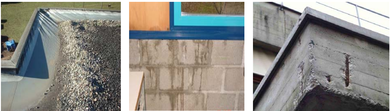
Figure. 1: Degraded building envelope elements

The PETRA project, is the answer to the lack of rapid assessment online decision making support tools for analyzing a complete building renovation. The tool is accessible through an online platform which also provides users with information such as documents and data on building maintenance and renovation. This platform is the interface of the new competence centre (“Centro di competenza sul risanamento e la manutenzione degli edifici”) based on the partnership between the Institute for Applied Sustainability to the Built Environment (ISAAC) in Ticino and the laboratory for construction and Conservation (LCC) and the laboratory for economics and environmental management (REME) at the EPFL in Lausanne.