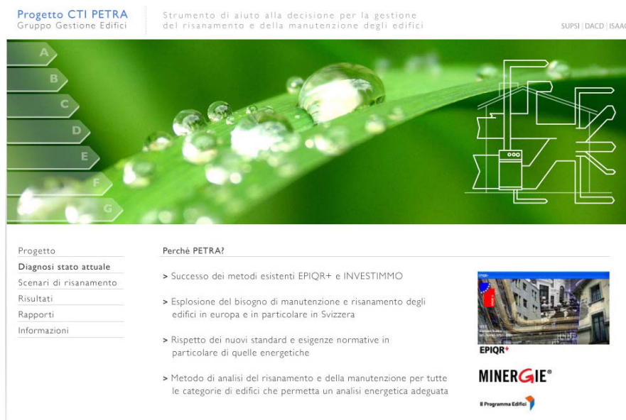
Figure. 3: Platform design

The tool and platform will change the way actors in building management and renovation planning work and will become a benchmark for the encouragement and the carrying out of works that lessen energy consumption of buildings.