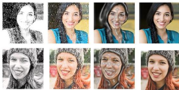
Fig. 3. Example of image retrievals using query image from big datasets of PASCAL MTH, MSD, SLAR, CDH, and RADAR with various RGB pixel values

Object detection often has error rate because the object or object does not include the pattern specified by the algorithm and usually has to be supplemented with an additional algorithm. The algorithms are usually used for detecting smaller parts to obtain more detailed images. For example, in face processing, the algorithm is used to identify the element of head and face which has a lower