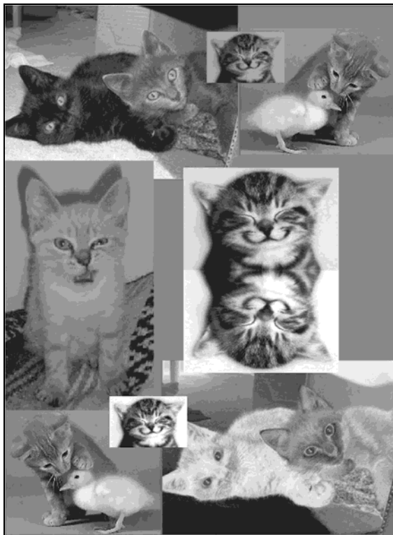
Figure 2: Example of Student Homework (Full color examples of student work can be found at: http://coweb.cc.gatech.edu/cs1315 )

Many students were clearly excited about the potential for using media in ways they had not previously encountered. Two students reported on the midterm survey that they had written programs to reverse popular songs, in order to find out if there were hidden messages. One student reported using Python to create an online scrapbook. Students often turned in homework assignments that included far more complex code than was required. For one homework assignment, students were directed to create a collage in which the same image appeared at least three times with some different visual manipulation each time. As can be seen in the example in Figure 2 (which was showcased by voluntary public posting on the collaborative website), many students accomplished considerably more than the minimum requirements. Some programs reached over 100 lines in length.