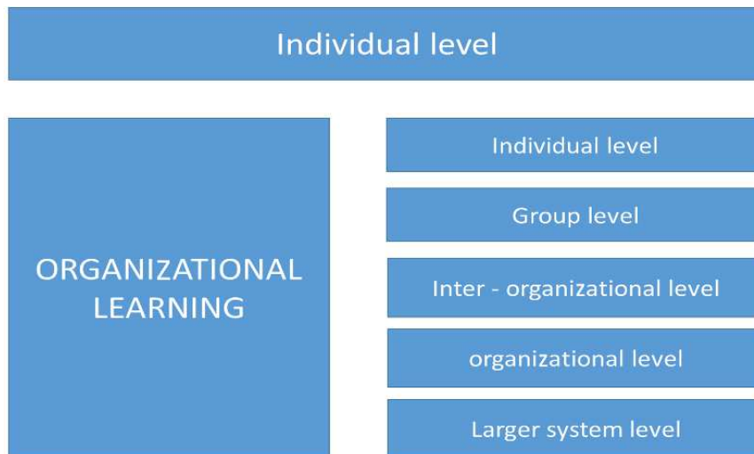
Fig. 2. The flow of learning across levels

Organizational learning is multilevel (e.g., individual, group, organizational and inter-organizational), and it is, therefore, important that organizations consider the flow of learning across all levels (Crossan, Lane, White and Djurfeldt, 1995).