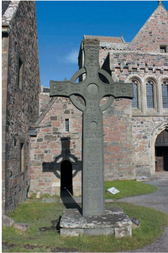
Figure 5. St John's Cross replica casts a shadow on St Columba's Shrine.

a timeless quality, which the original in the museum no longer conveys in the same way. As Dora reminds us, 'emotion springs up unbidden, and the museum doesn't do that for me'.