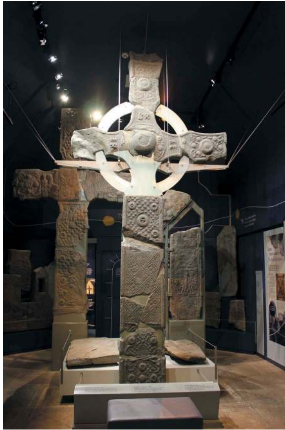
Figure 3. St Oran's, St John's and St Matthew's Crosses relocated for conservation purposes in the Iona Abbey Museum, upgraded in 2013.