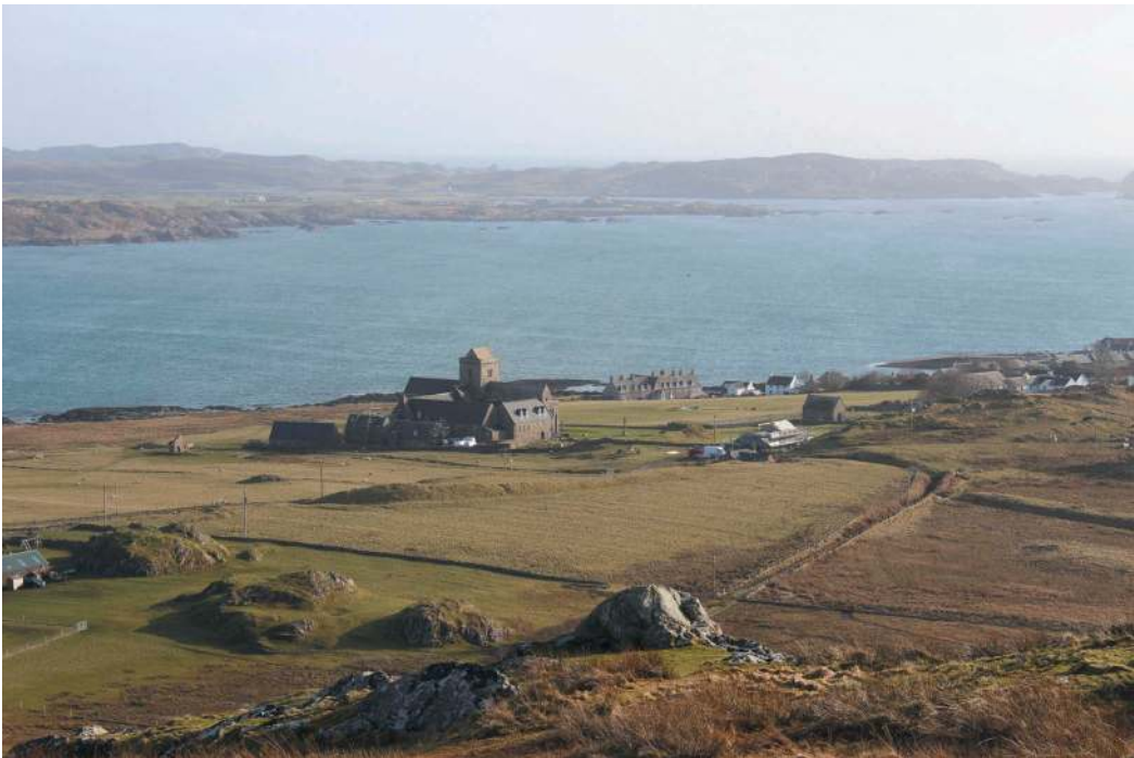
Figure 4. Iona Abbey in its landscape setting.