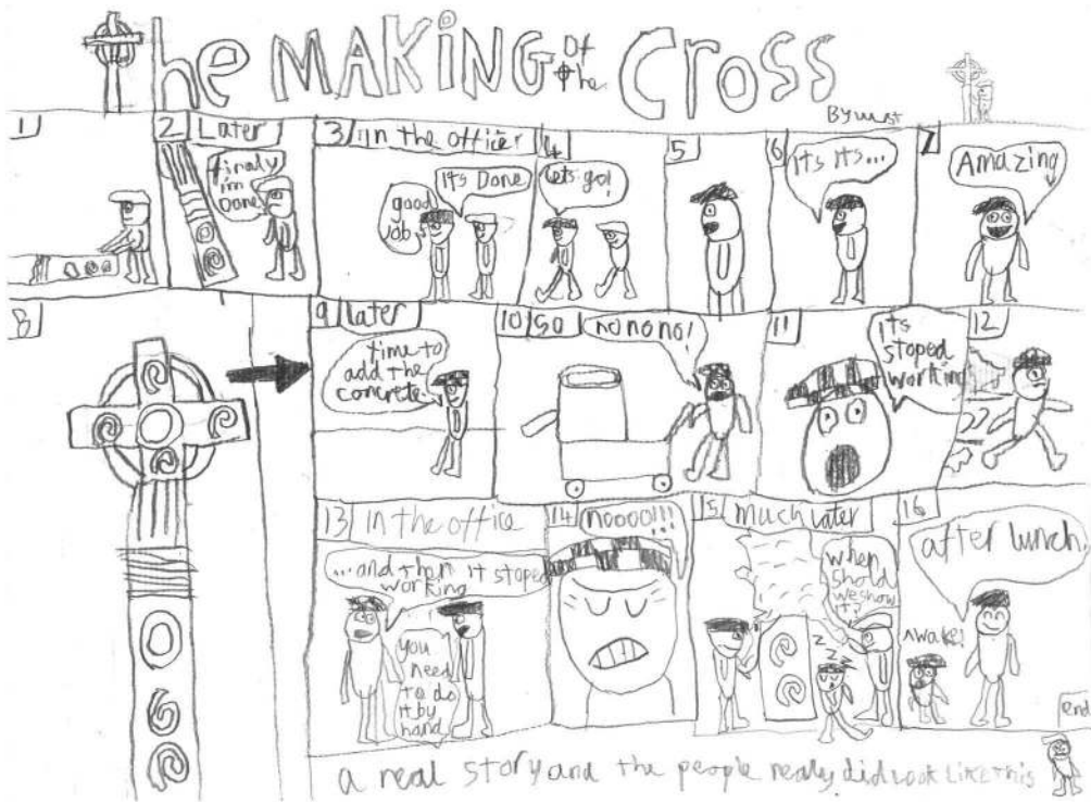
Figure 8. Child's artwork inspired by the biography of the St John's Cross replica.

We therefore call for a new theory of replicas that encompasses the part that networks of relations – between people, objects and places – play in the production and negotiation of authenticity, and the ways these are embodied in the biographies and materialities of things. Our research shows that this applies to replicas, as well as historic originals. They can acquire authenticity and 'pastness', linked to materiality, craft practices, creativity, and place. Yet, their authenticity is founded on the networks of relationships between people, places and things that they come to embody, as well as their dynamic material qualities. The cultural biographies of replicas, and the 'felt relationships' associated with them, play a key role in the generation and negotiation of authenticity, while at the same time informing the authenticity and value of their historic counterparts through the 'composite biographies' produced (see Jones et al. 2017 for a discussion of parallel processes with respect to digital, 'virtual' replicas).