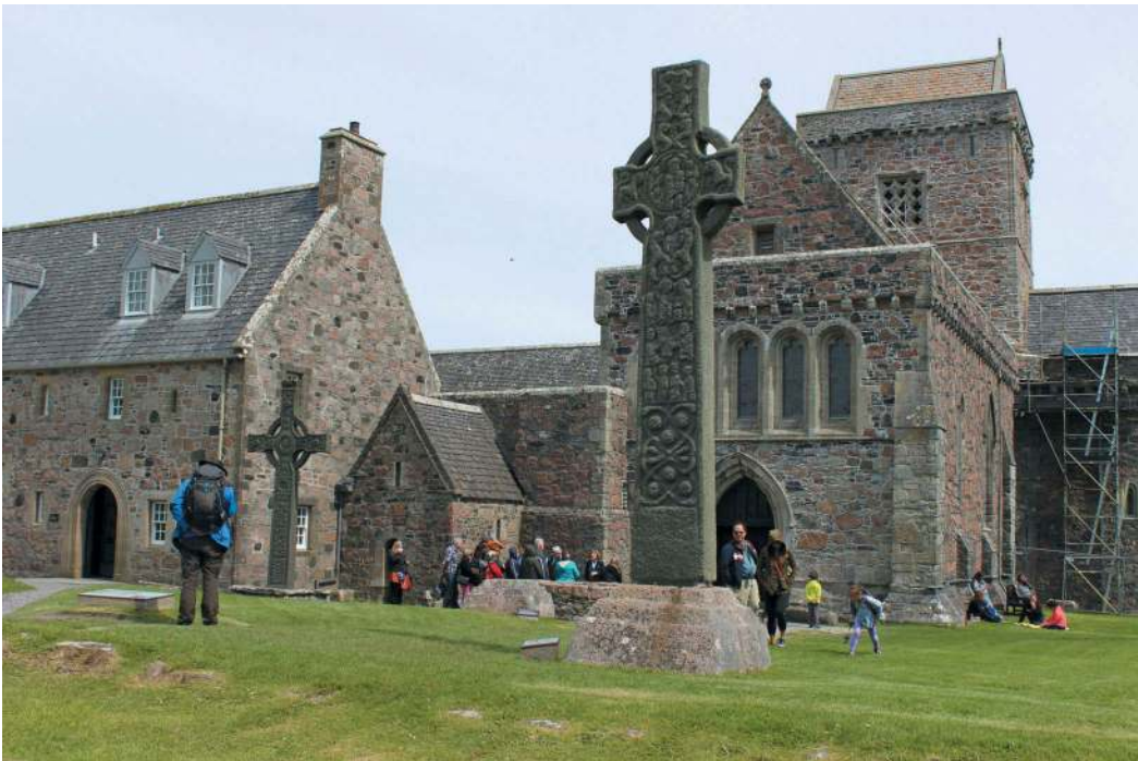
Figure 2. Crosses from left to right, St John's (replica in original base), St Matthew's (empty base in front of group of visitors) and St Martin's, in front of Iona Abbey.