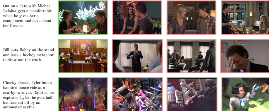
Fig. 5: Qualitative results of the MoEE+CBM model for cross-movie retrieval. On the left, we provide the input query, and on the right, we show the top 4 video clips retrieved by our model on the CMD test set . A single frame for each video clip is shown. The matching clip is highlighted with a green border, while the rest are highlighted in red (best viewed in colour). Note how our model is able to retrieve semantic matches for situations (row 1: male/female on a date), high level abstract concepts (row 2: the words ‘stand’ and ‘truth’ are mentioned in the caption and the retrieved samples show a courtroom, men delivering speeches and a policeman’s office) and also notions of violence and objects (row 3: scythe).