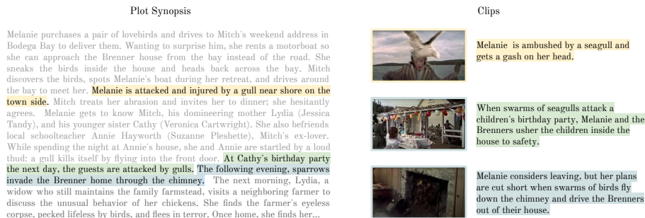
Fig. 6: A sample Wikipedia movie plot summary (left) aligned with an ordered sample of clips and their descriptions (right). The alignment was achieved using Jumping Dynamic Time Warping [61] of sentence-level BERT embeddings, note how the alignment is able to skip a number of peripheral plot sentences.

A unique aspect of the Condensed Movies Dataset is the story-level captions accompanying the ordered key scenes in the movie. Unlike existing datasets [2] that contain low level visual descriptions of the visual content, our semantic captions capture key plot elements. To illustrate the new kinds of capabilities afforded by this aspect, we align the video descriptions to Wikipedia plot summary sentences using Jumping Dynamic Time Warping [61] of BERT sentence embeddings. This alignment allows us to place each video clip in the global context of the larger plot of the movie. A qualitative example is shown in Fig. 6. Future work will incorporate this global context from movie plots to further improve retrieval performance.