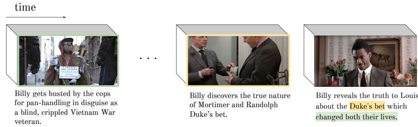
Fig. 1: Condensed Movies: The dataset consists of the key scenes in a movie (ordered by time), together with high level semantic descriptions. Note how the caption of a scene (far right) is based on the knowledge of past scenes in the movie – one where the Dukes exchange money to settle their bet (highlighted in yellow), and another scene showing their lives before the bet, homeless and pan-handling (highlighted in green).

in large numbers on YouTube and are a good source of supervision for video-text models as the speech describes the video content. In a similar spirit, videos from the MovieClips channel on YouTube 1 , which contains the key scenes or clips from numerous movies, are also accompanied by a semantic text description describing the content of each clip.