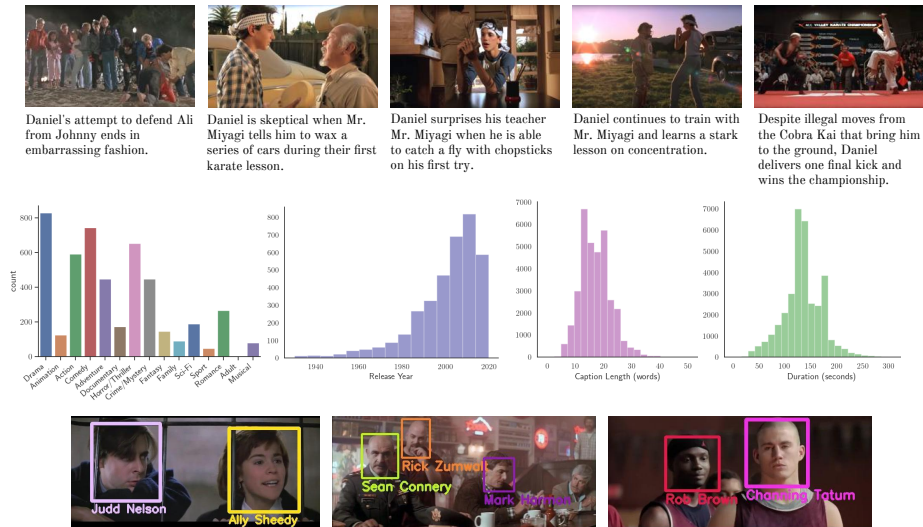
Fig. 2: The Condensed Movie Dataset (CMD) . Top : Samples of clips and their corresponding captions from The Karate Kid (1984) film. In movies, as in real life, situations follow from other situations and the combination of video and text tell a concise story. Note: Every time a character is mentioned in the description, the name of the actor is present in brackets. We remove these from the figure in the interest of space. Middle, from left to right : Histogram of movie genres, movie release years, description length and duration of video clips. Best viewed online and zoomed in. Bottom : Example face-tracks labelled with the actor’s name in the clips. These labels are obtained from cast lists and assigned to facetracks using our automatic labelling pipeline.

licensed, freely available YouTube channel: MovieClips 2 . We note that a common problem plaguing YouTube datasets today [43,16,15,44] is the fast shrinkage of datasets as user uploaded videos are taken down by users (over 15% of Kinetics-400 [15] is no longer available on YouTube at the time of writing, including videos from the eval sets). We believe our dataset has longevity due to the fact that the movie clips on the licensed channel are rarely taken down from YouTube. Also, this is an actively growing YouTube channel as new movies are released and added. Hence there is a potential to continually increase the size of the dataset. We note that from the period of 1st Jan 2020, to 1st September 2020, only 0.3% of videos have been removed from the YouTube channel, while an additional 2,000 videos have been uploaded, resulting in a dataset growth of 5.8% over the course of 9 months.