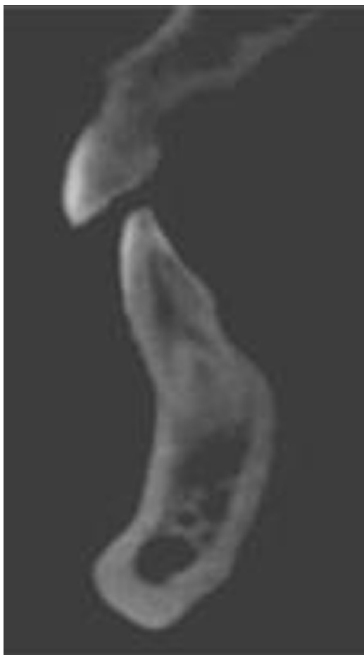
Figure 3 CBCT images showing additional canal morphology (type IX) in permanent mandibular anterior teeth.

Abbreviation: CBCT, cone-beam computed tomography.