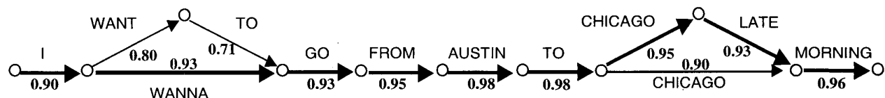
Figure 2: Word-graph generated for the example in Figure 1. The bold arrows indicate the best hypothesis.

The CU Communicator utilizes parallel banks of recognizers to obtain hypotheses from speaker-independent and female adapted telephone acoustic models. In the next sections we present several methods to use confidence measures for combining hypotheses from different decoders to improve speech recognition accuracy.