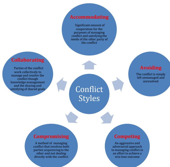
Figure 1. Description of conflict styles. Adapted from Anjum et al. (2014).

Anjum, Karim, and Bibi (2014) identified and described the characteristics of conflict styles as shown in figure 1.