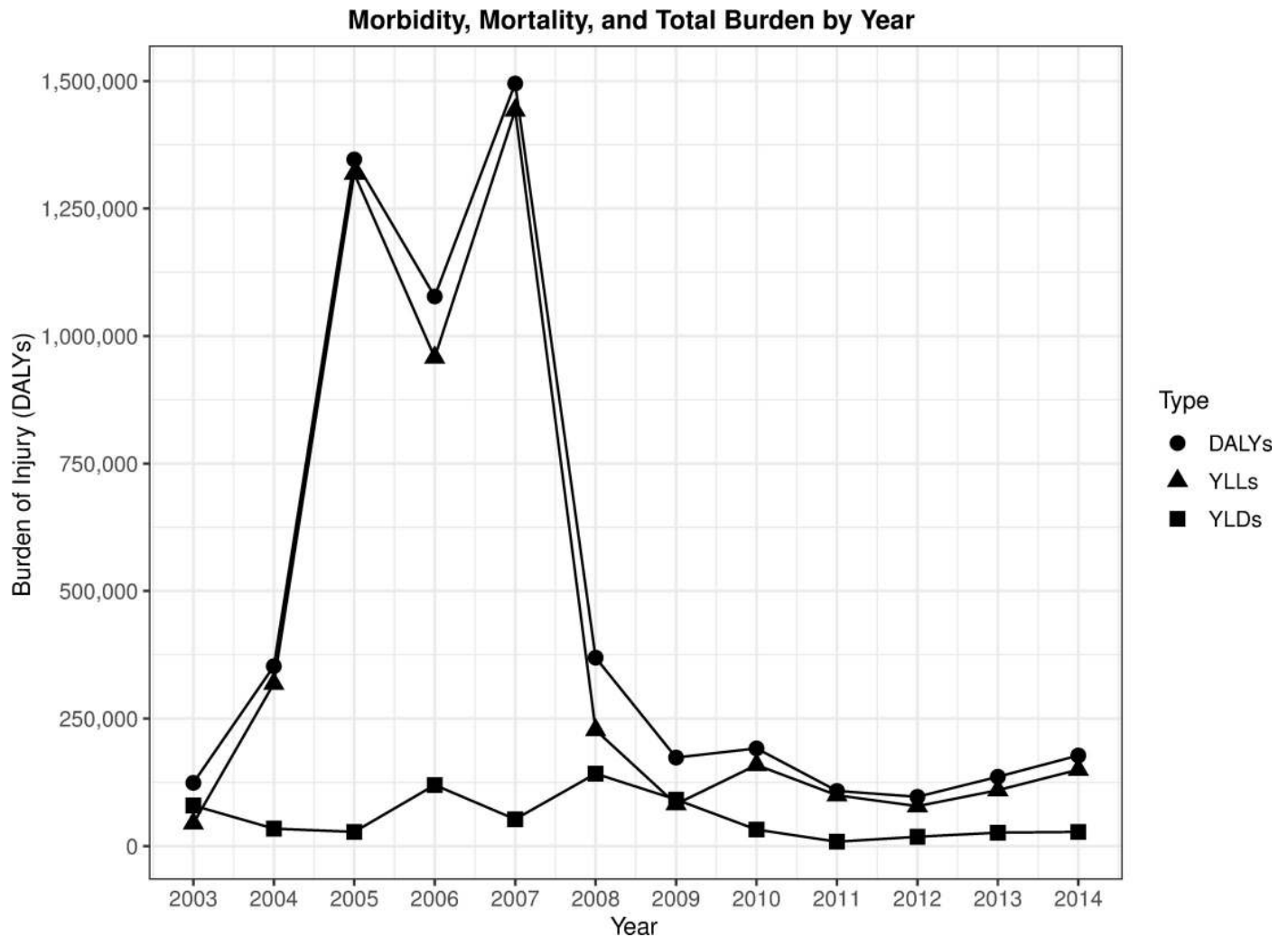
Fig 1. Burden of conflict-related intentional injury by year in Baghdad, Iraq, 2003–2014, portraying total DALYs, as well as contributions of YLLs and YLDs. Source of data: survey of 900 Baghdad residents in May and June 2014, regarding household injury events between 2003 and 2014. DALY, disability-adjusted life year; YLD, year lived with disability; YLL, year of life lost.

https://doi.org/10.1371/journal.pmed.1003673.g001