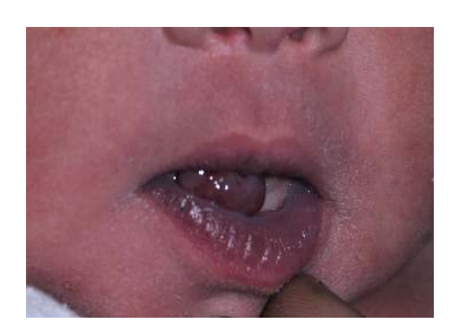
FIGURE 1: Patient as seen at initial consultation.