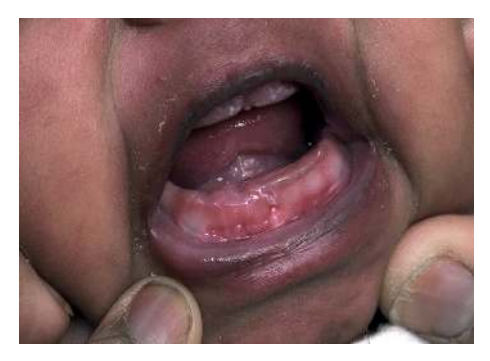
FIGURE 4: Patient at follow-up.