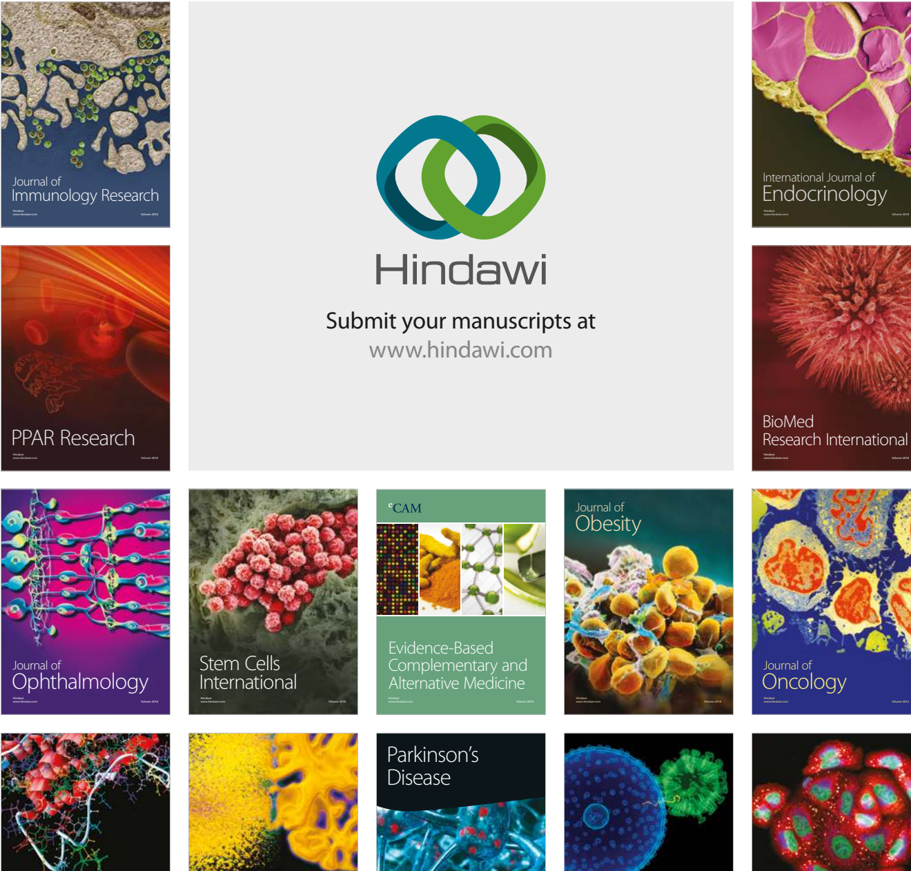
Computational and Mathematical Methods in Medicine