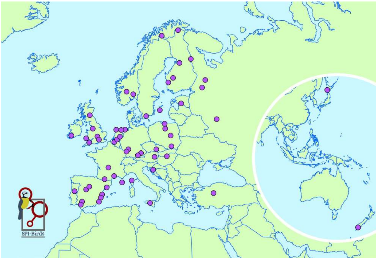
FIGURE 1 A map showing the location of the populations with the data hosted in the SPI-Birds database as of August 2020