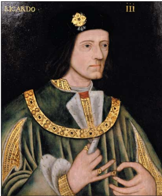
Conscience, for Shakespeare's Richard III, was "but a word cowards use"

that is, paternalism. Their values crept into clinical decisions. 1,2 This has been squarely overturned by greater patient participation in decision making and the importance given to respecting patients' autonomy. 3 More recently, doctors' values have reappeared as a right to conscientiously object to offering certain medical services. Examples include, refusal to offer termination of pregnancy, especially late term termination, to women who are legally entitled to it and refusal to provide reproductive advice and help to gay couples, single women, or others deemed socially unacceptable.