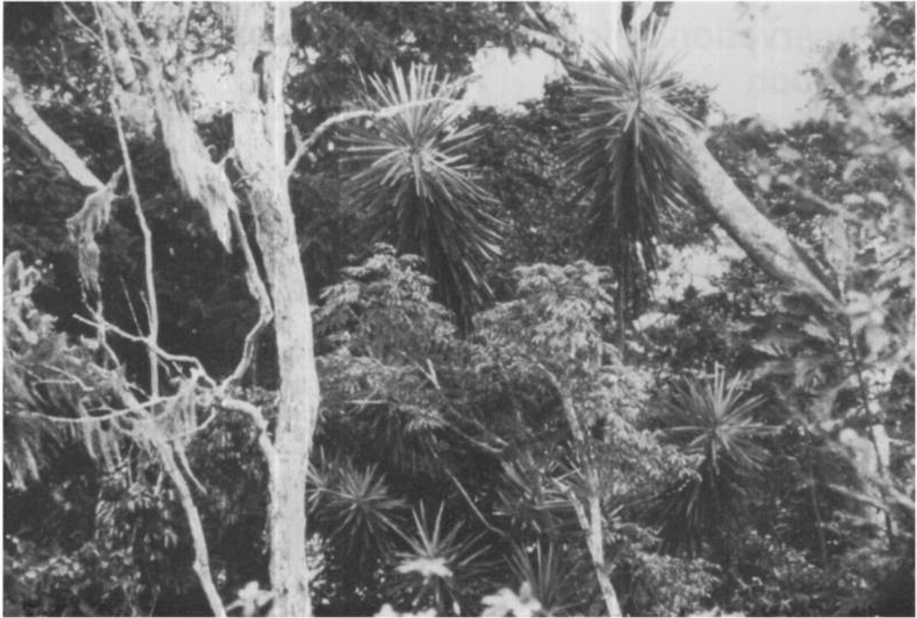
Elfin thicket covering the crests of the Belinga Mountains in north-east Gabon (C. E. G. Tutin and M. Fernandez).

per annum, with high humidity throughout the year. The region has a very distinct flora with a high number of endemics. Most notable is the okoumé Aucoumea klaineana , a West African endemic, which is the dominant species and a preferred timber tree for veneer and plywood. Gabon accounts for about 90 per cent of the world's market in okoumé. The coastal area is interspersed with numerous lagoons, rivers and mangroves. Threatened fauna include the manatee Trichechus senegalensis and leatherback turtle Dermochelys coriacea . This zone is probably the only place remaining in Africa where the western lowland gorilla Gorilla g. gorilla and forest elephant Loxodonta a. cyclotis can be found on Atlantic Ocean beaches.