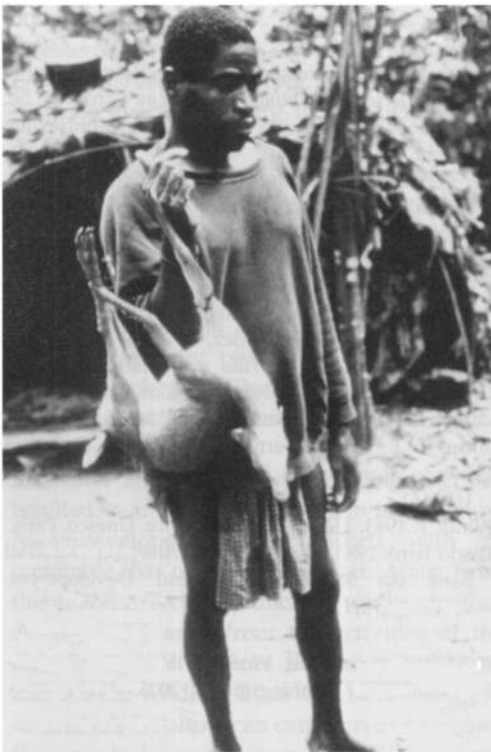
Blue duiker taken by subsistence hunting.

First, institutional self-sufficiency so that government organizations, NGOs and university research centres are effectively designing, funding