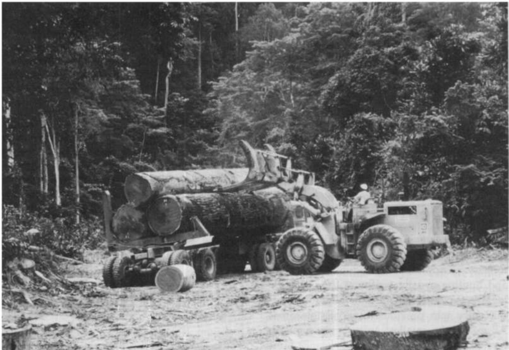
Logging in the Lopé Reserve.

The Gabonese Government has recognized the necessity for a forest management strategy